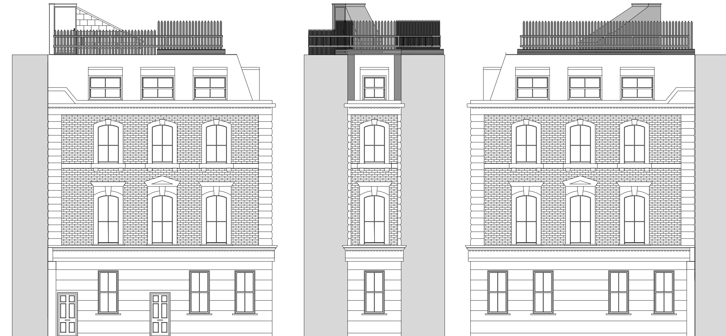
Existing elevation A