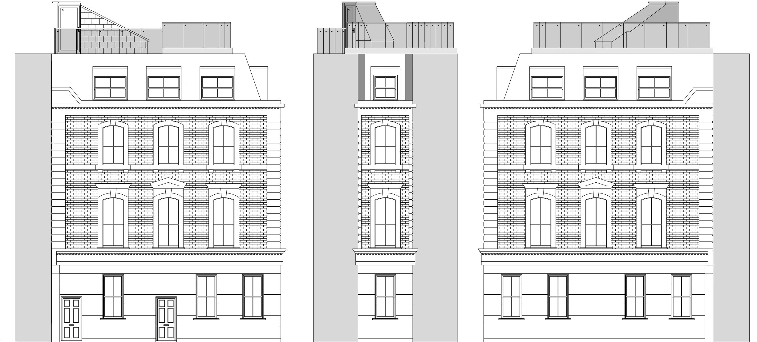
Proposed elevation A