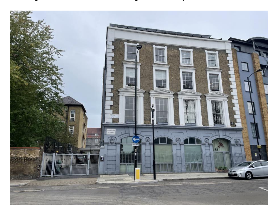
View of the new gates from York Way in the current building setting

The new gates compliment the façade of the building and provide an aesthetically pleasing appearance when viewing the building on York Way. The gates have been designed to work in the current environment with the existing steel security bars to the large arched windows to the ground storey.