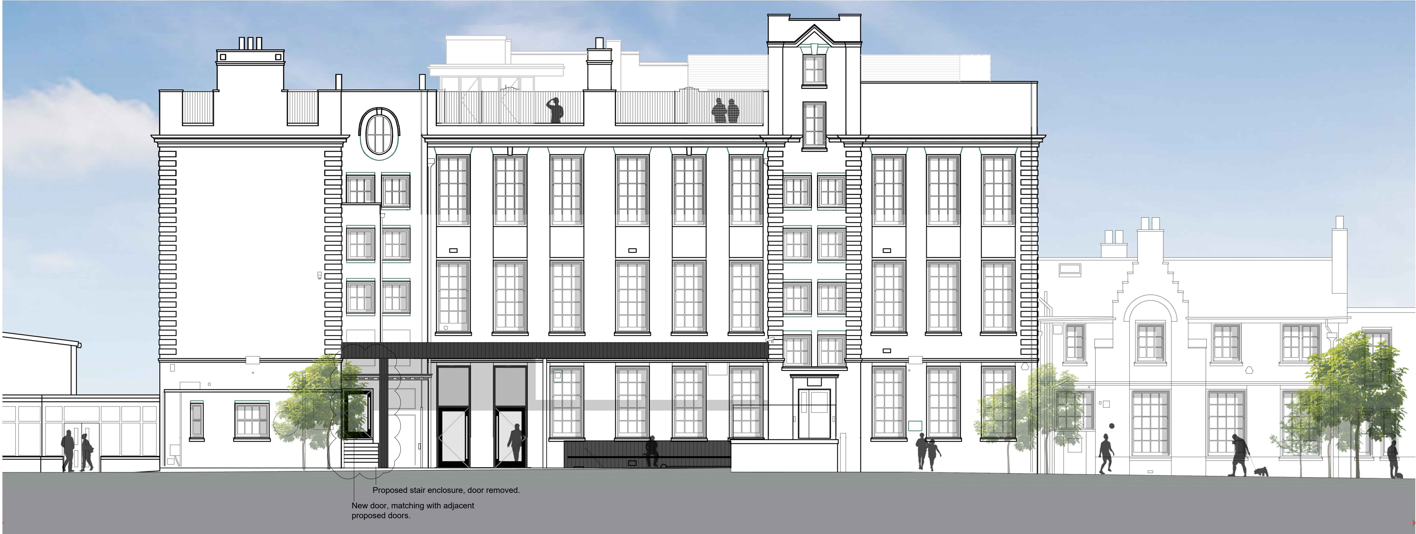
02 PROPOSED SOUTH ELEVATION 1:100