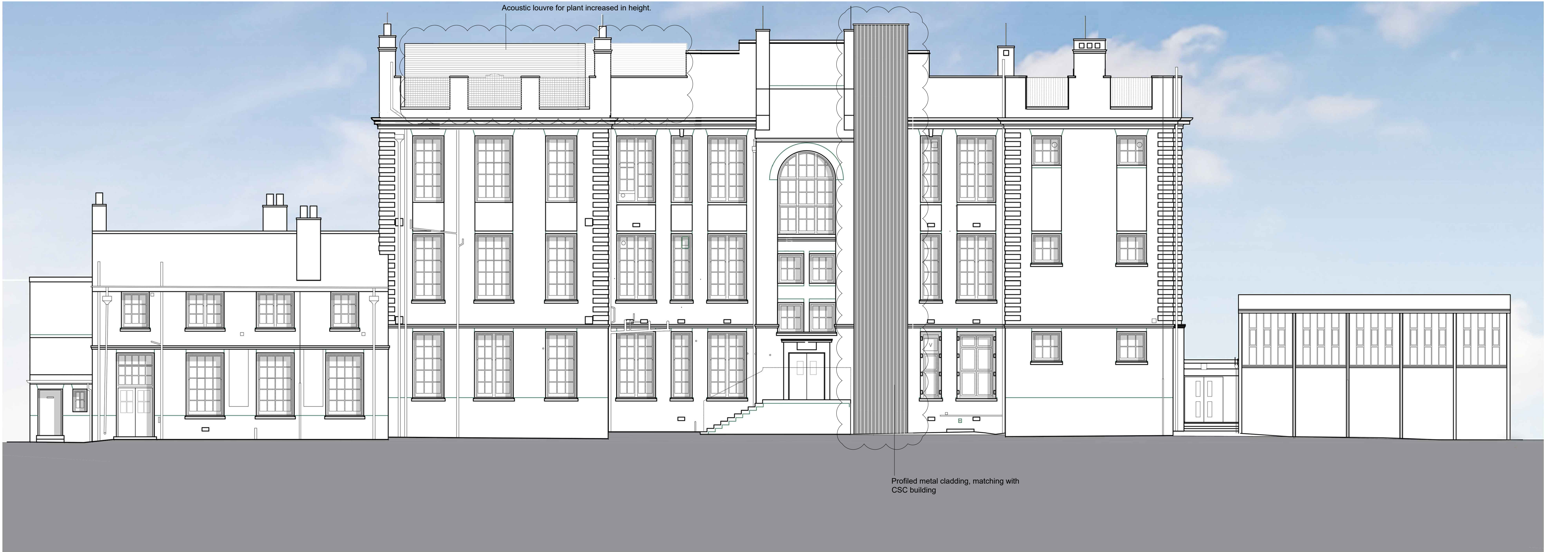
01 PROPOSED NORTH ELEVATION 1:100