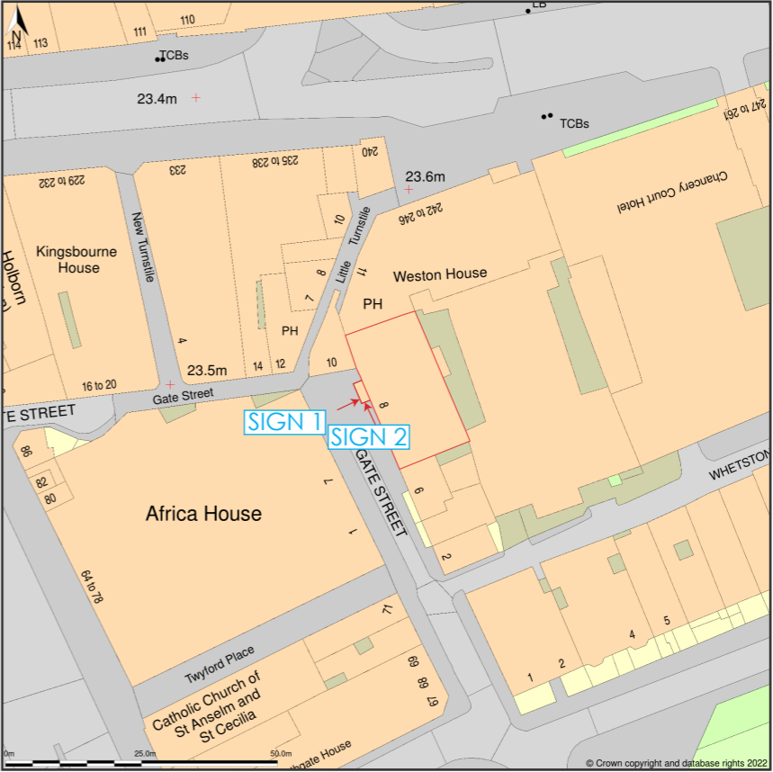
SITE PLAN Scale 1:1250