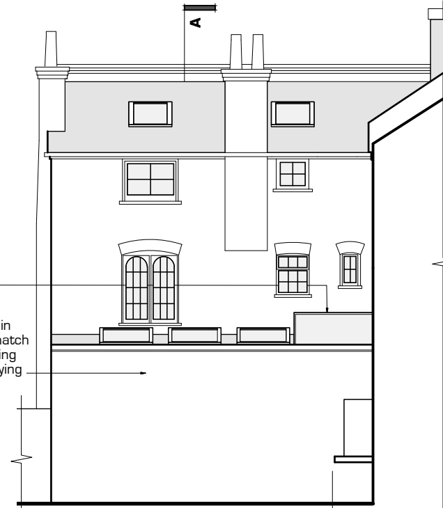
Proposed Flank Wall Side Elevation