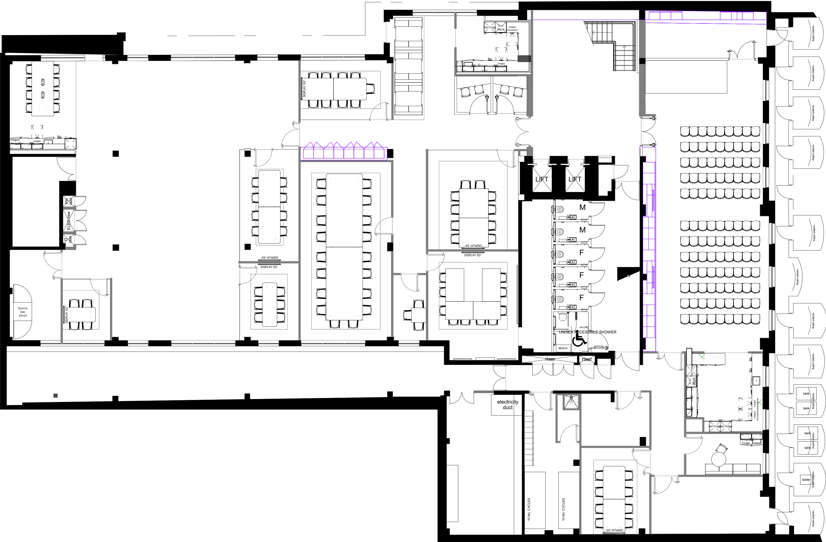
General Arrangement -LG 1 : 100