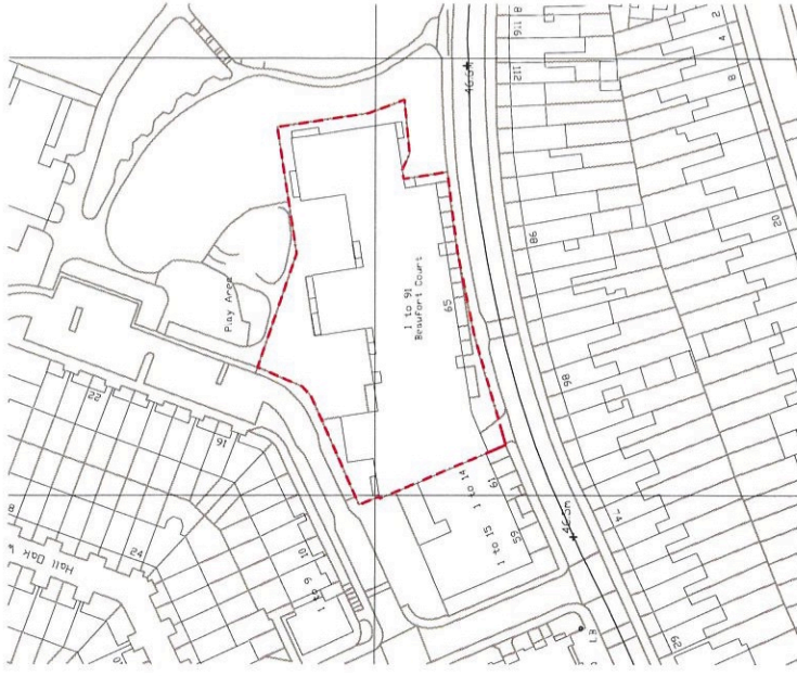
Site Location Plan 1:1250 @ A3