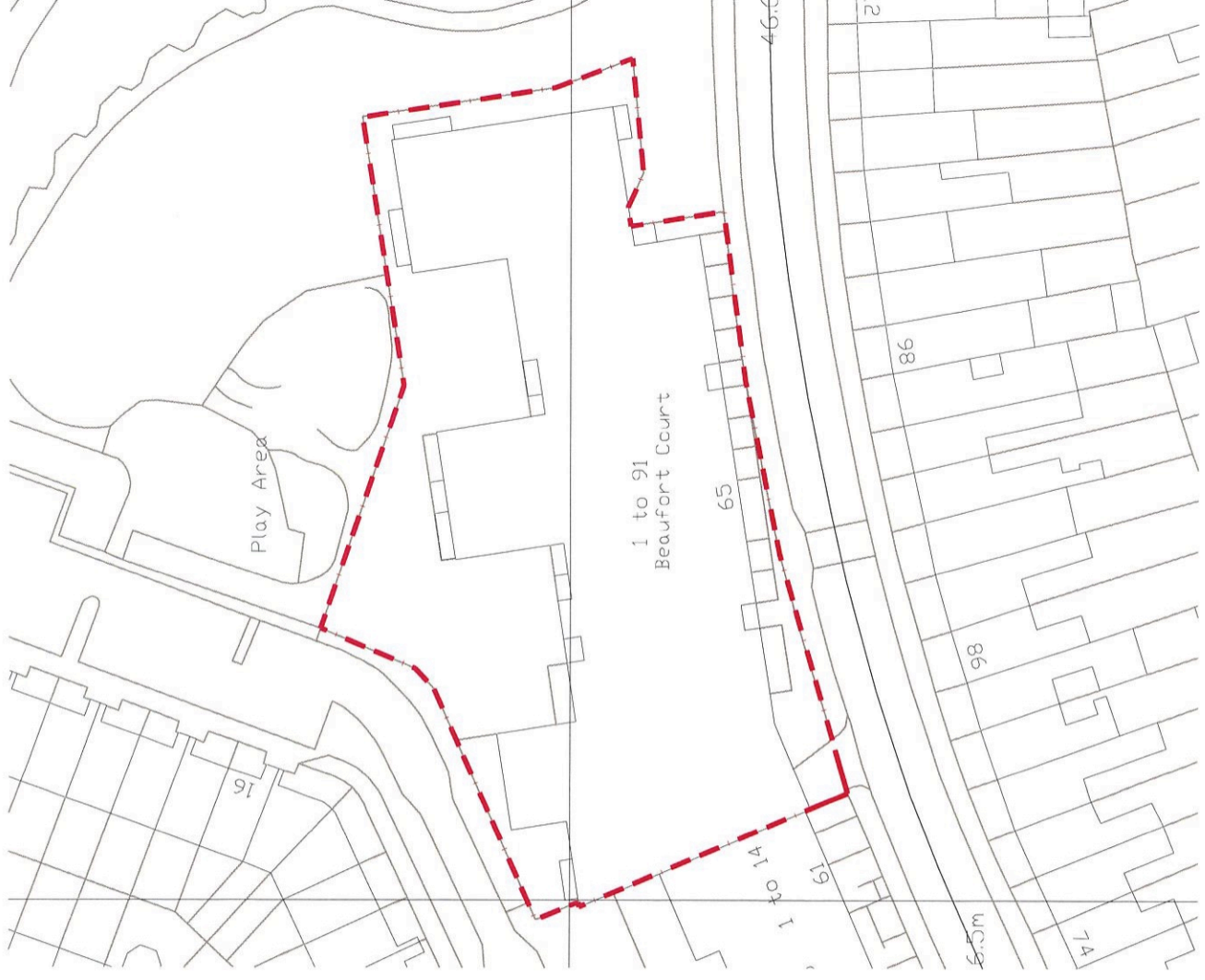
Block Plan 1:500 @ A3