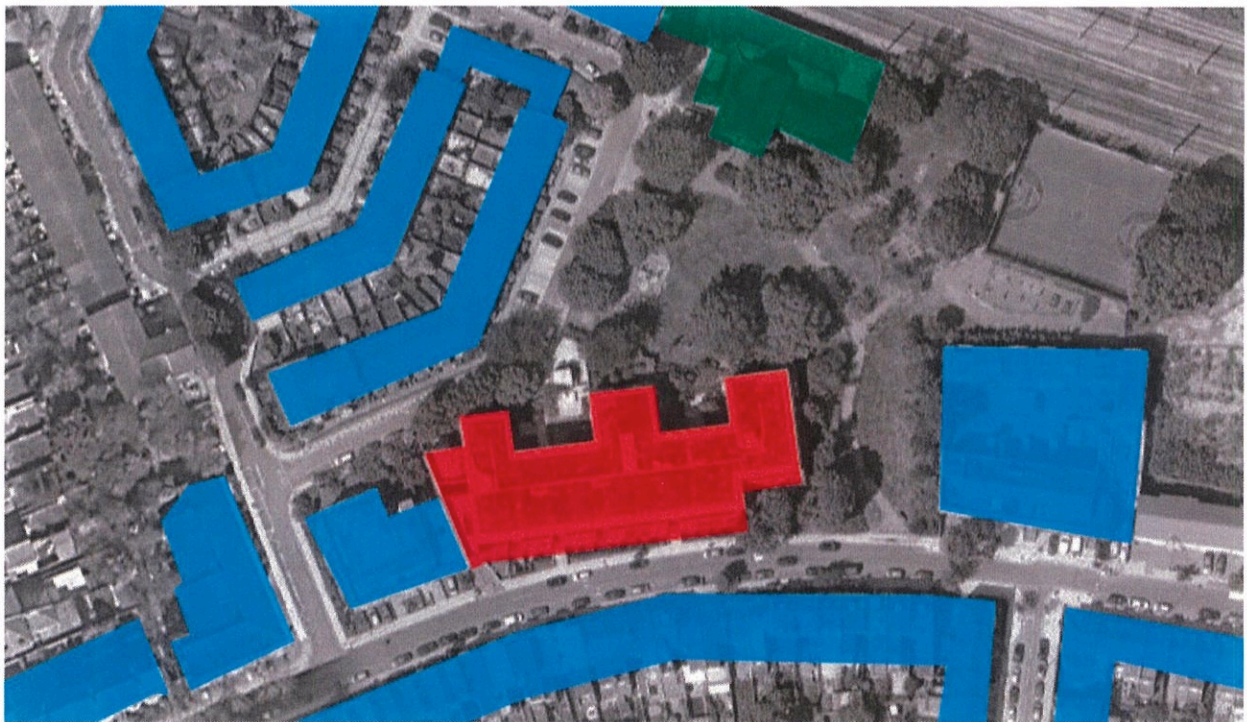
Figure 2. Site Location