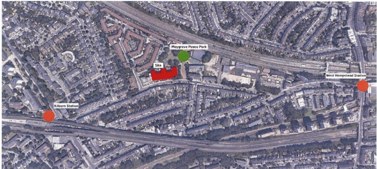
Figure 1. Site & Context Location