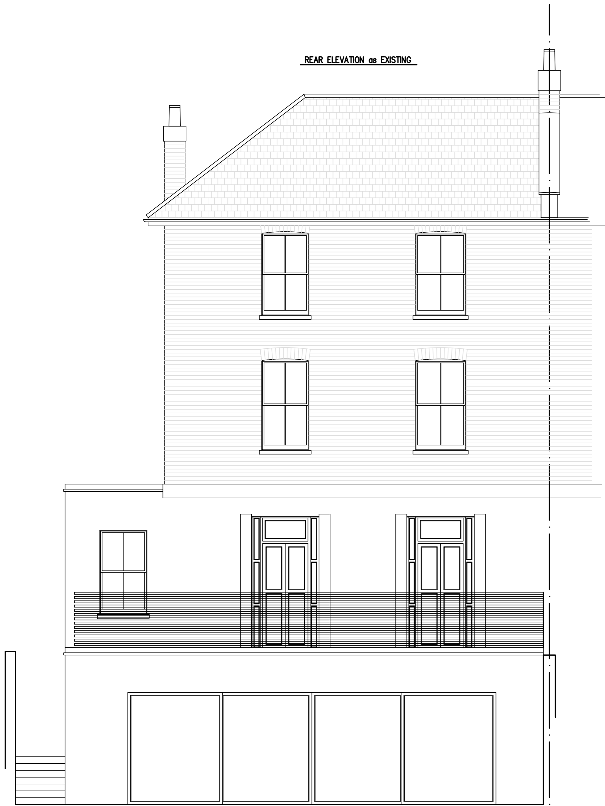
REAR ELEVATION as EXISTING