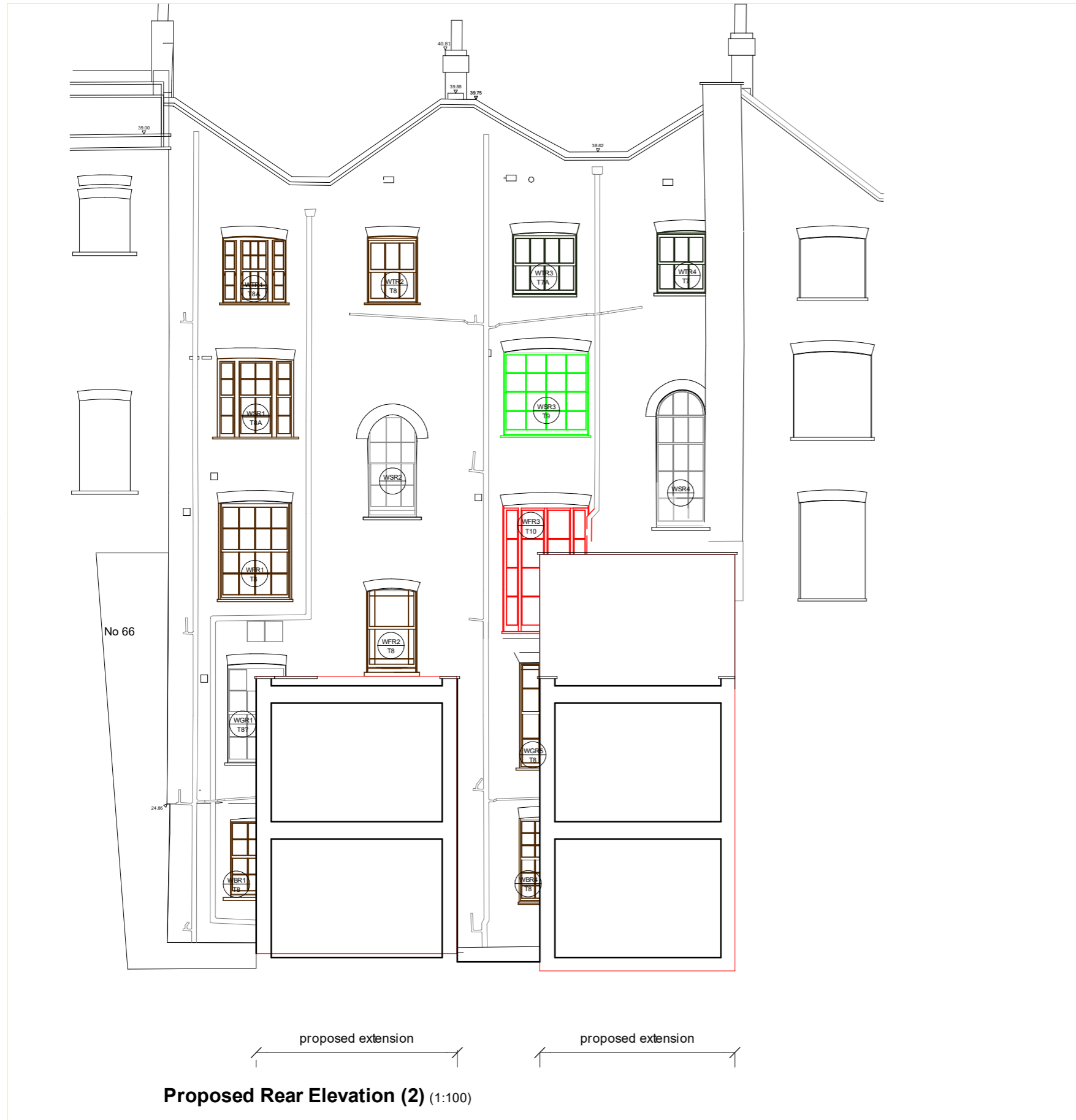
Proposed Rear Elevation (2) (1:100)