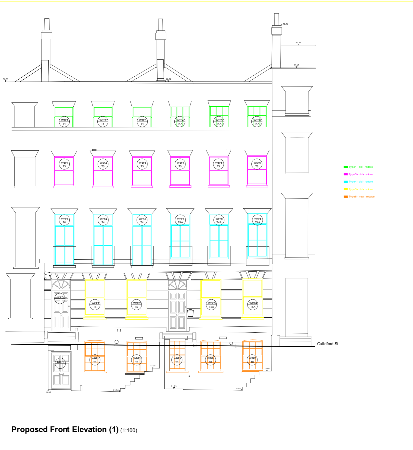
Proposed Front Elevation (1) (1:100)

DO NOT SCALE THIS DRAWING, DWG'S AVAILABLE ON REQUEST.