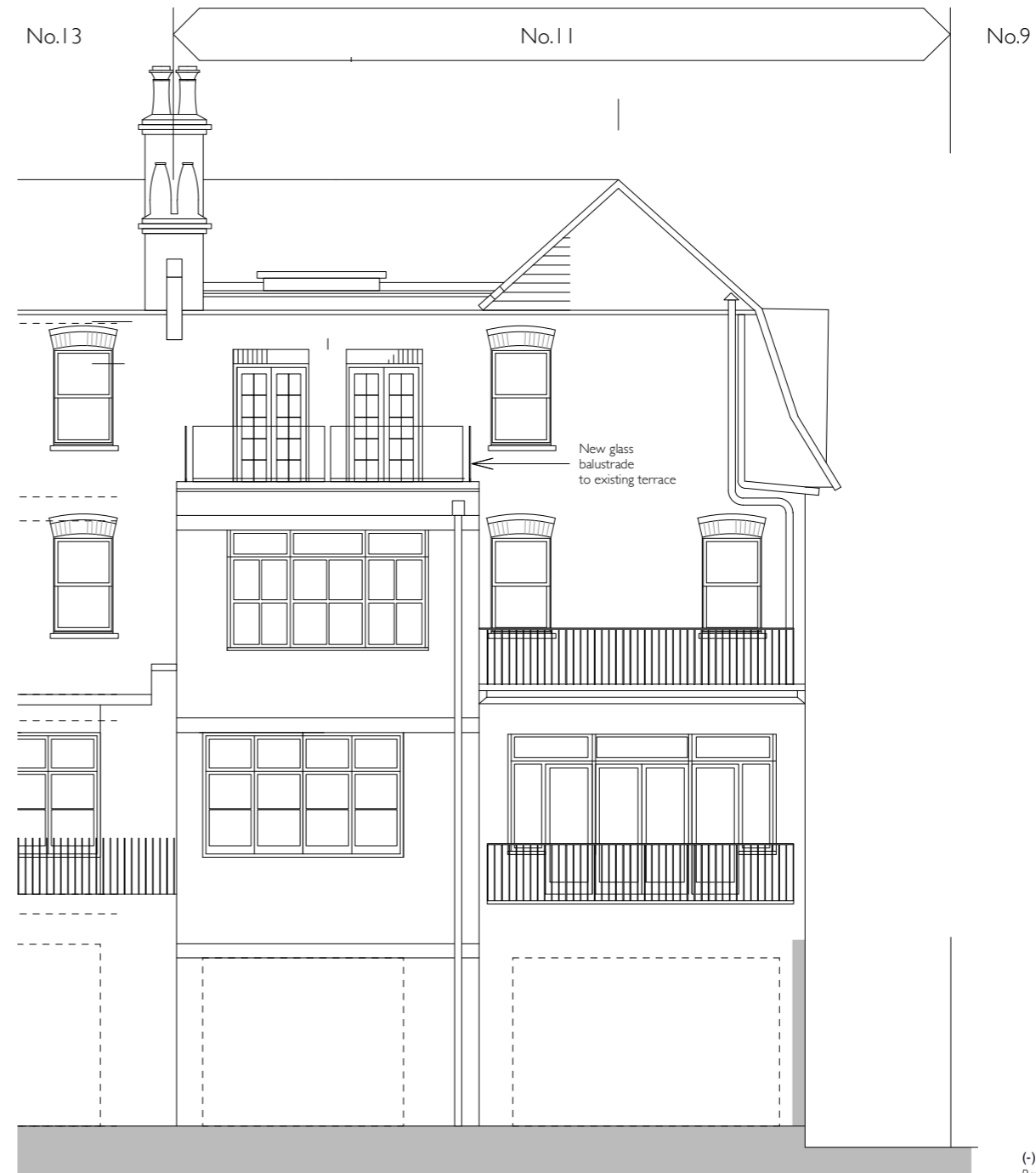
1 Existing West Elevation 1:100