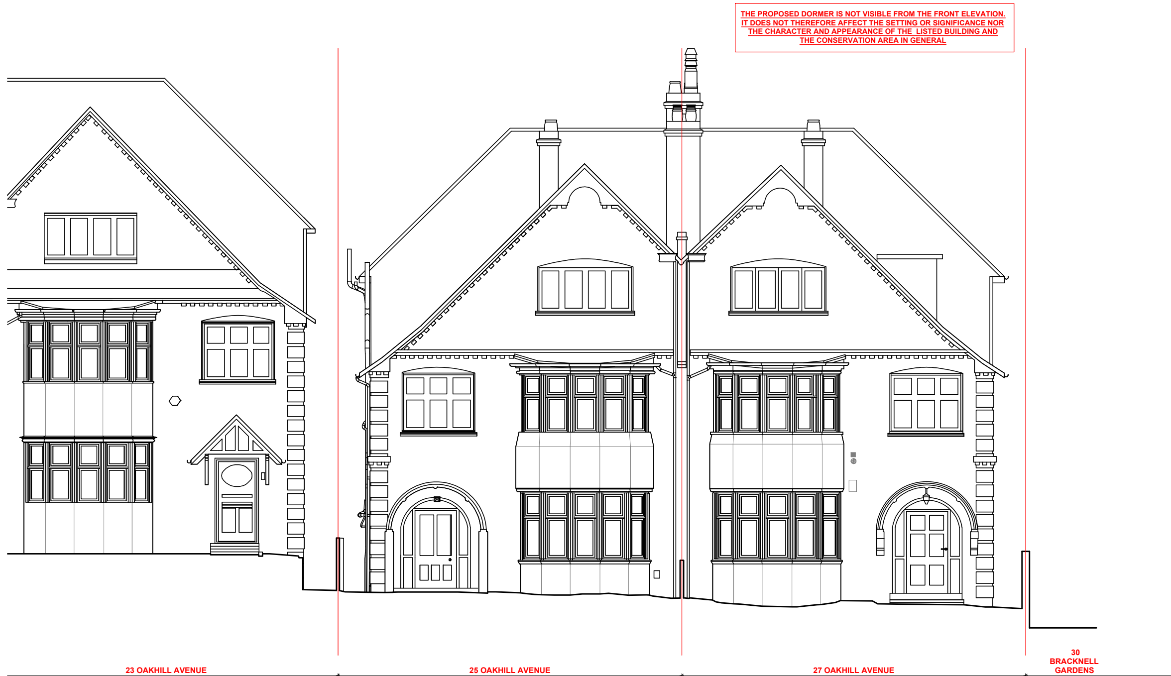
1 FRONT ELEVATION - PROPOSED_ SCALE 1:100 @ A3