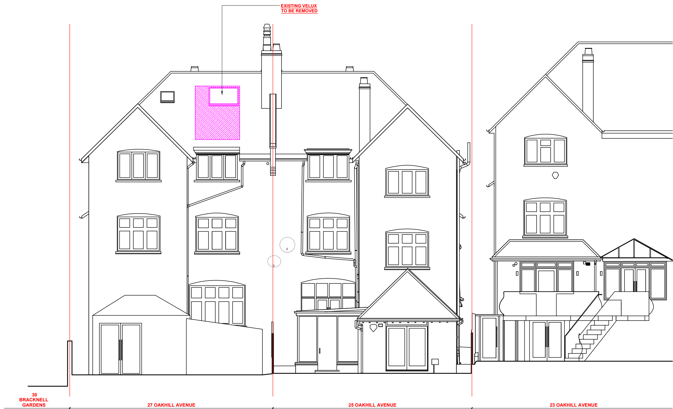
1 BACK ELEVATION - DEMOLITION_ SCALE 1:100 @ A3