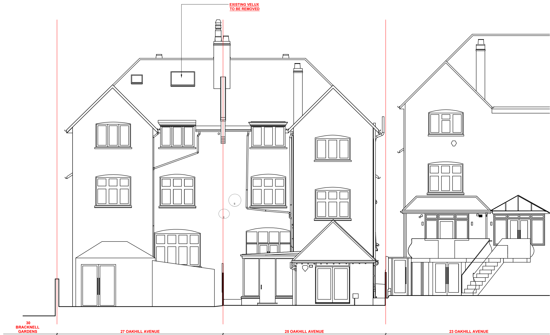
1 BACK ELEVATION - EXISTING_ SCALE 1:100 @ A3