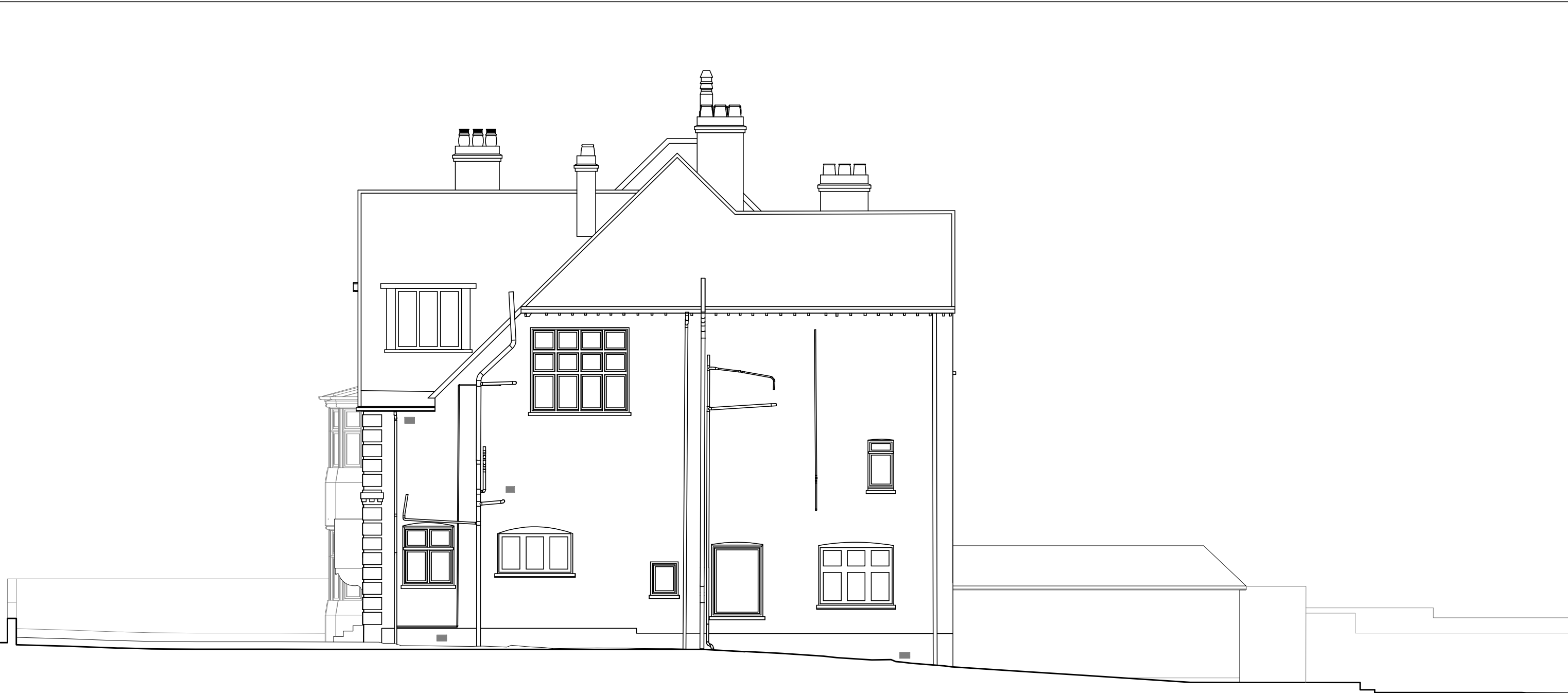
1 SIDE ELEVATION - EXISTING_ SCALE 1:100 @ A3