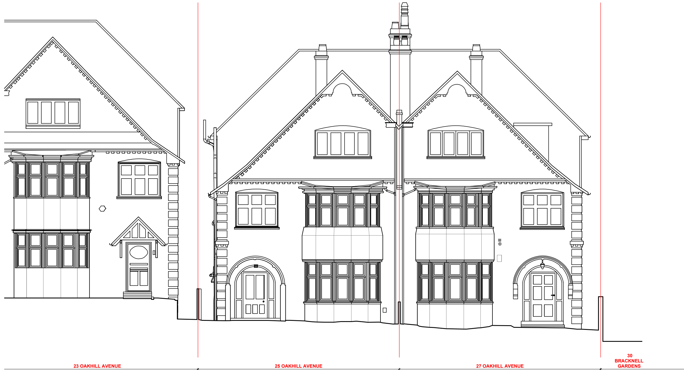
1 FRONT ELEVATION - EXISTING_ SCALE 1:100 @ A3