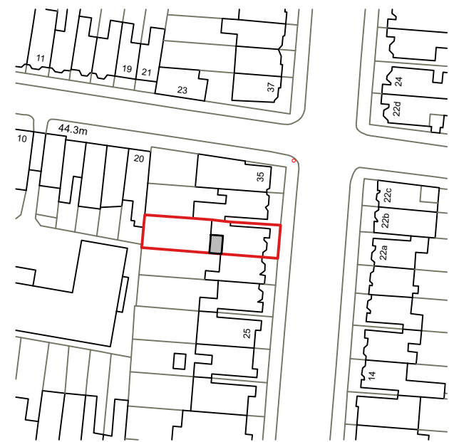
LOCATION PLAN | 1:1250