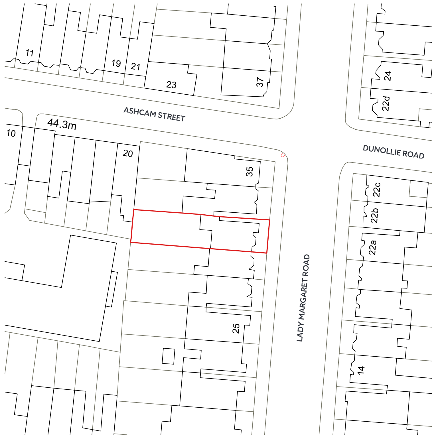
EXISTING BLOCK PLAN | 1:500