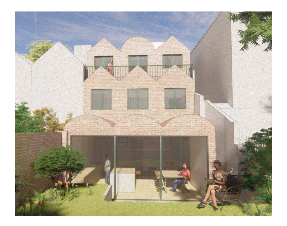
Figure 02 Brick formations rear roof

Figure 01 Visual of rear curved/ triangular Terrace/ Roof forms with brick on edge parapets