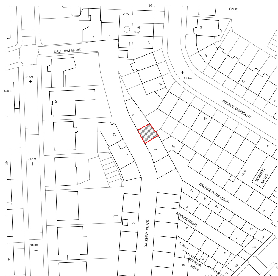
Plan A Location Plan E01.0 Scale 1:1250@A3