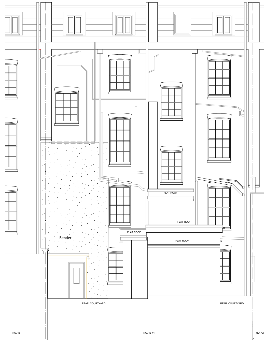
08 EXISTING WEST ELEVATION