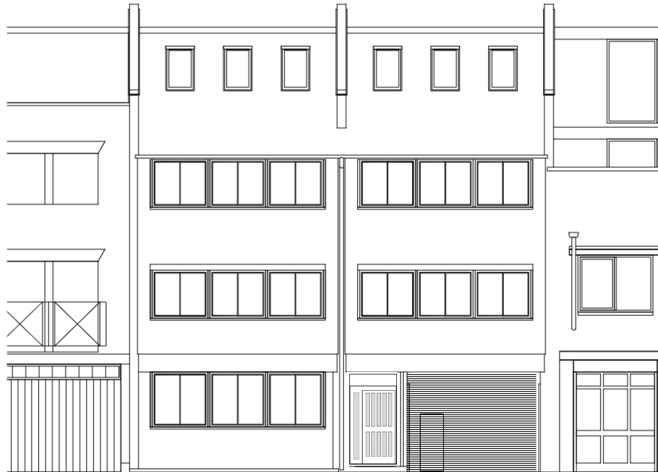
EX01 Existing Front Elevation Scale 1:500(A1), 1:100(B3)