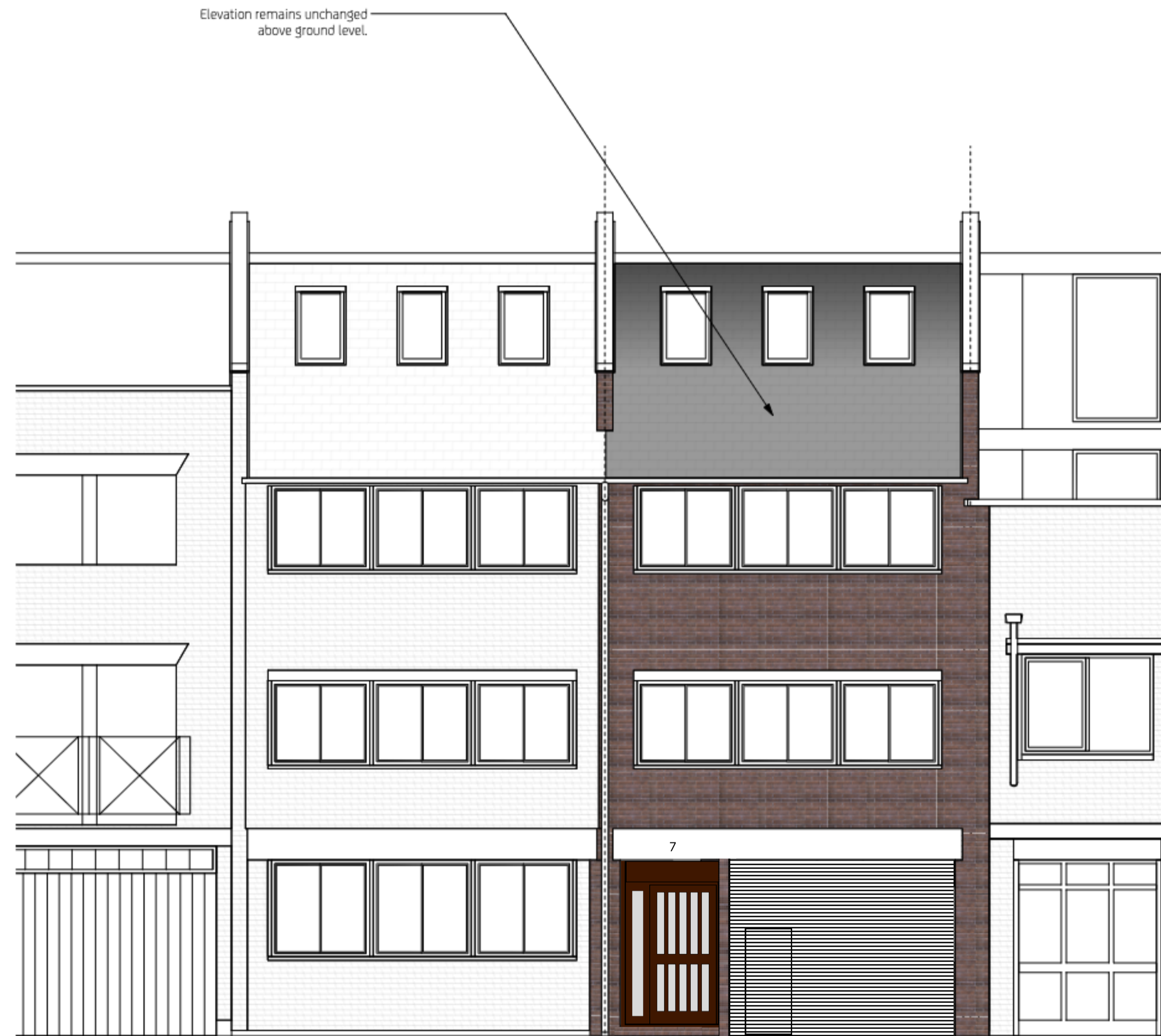
GE01 Proposed Front Elevation Scale 1:500(A1), 1:100(B3)