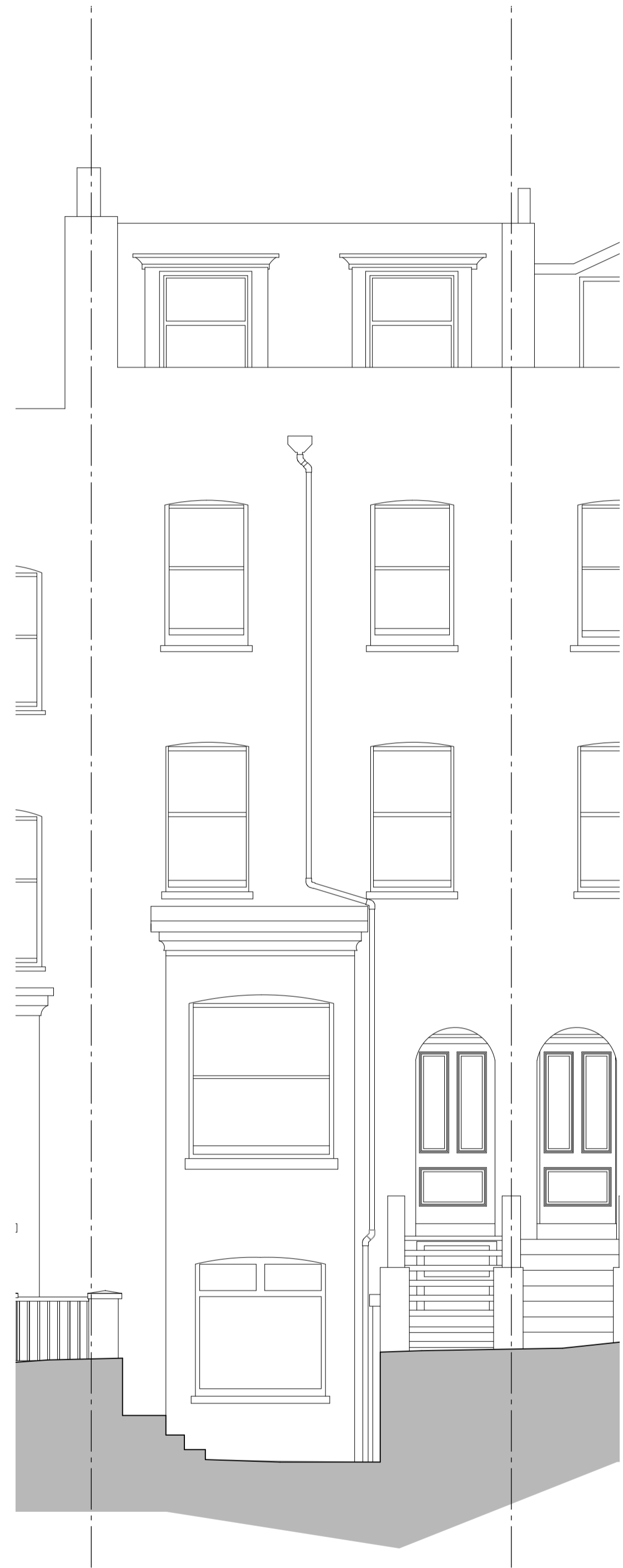
EXISTING FRONT ELEVATION 1:50 @ A1 / 1:100 @ A3

2. WORKS TO COMPLY WITH ALL RELEVANT BUILDING REGULATIONS AND CODES OF PRACTICE.