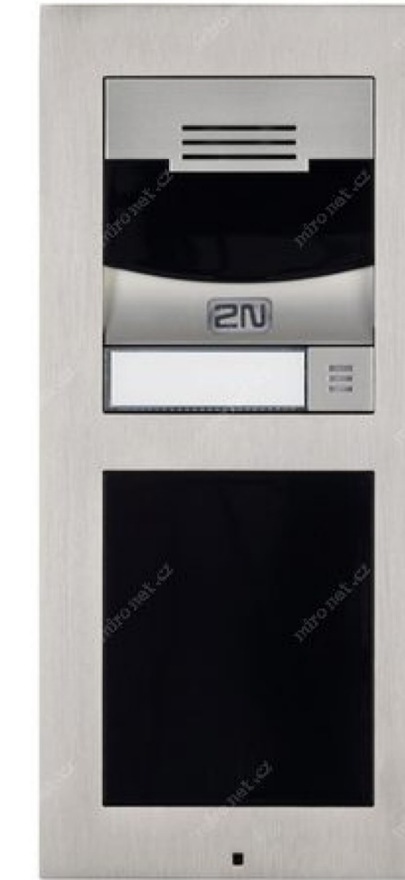
Proposed entry system in satin nickel finish. 2N IP VERSO DOOR ENTRY SYSTEM. Inset into joinery. 130mm (W) x 257mm (H)