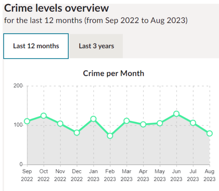
Line graph showing the number of crimes over the last twelve (12) months for Belsize ward.

London. Camden’s Statement of Licensing Policy sets out the Council’s approach to licensing and special licensing policies apply to these areas.”