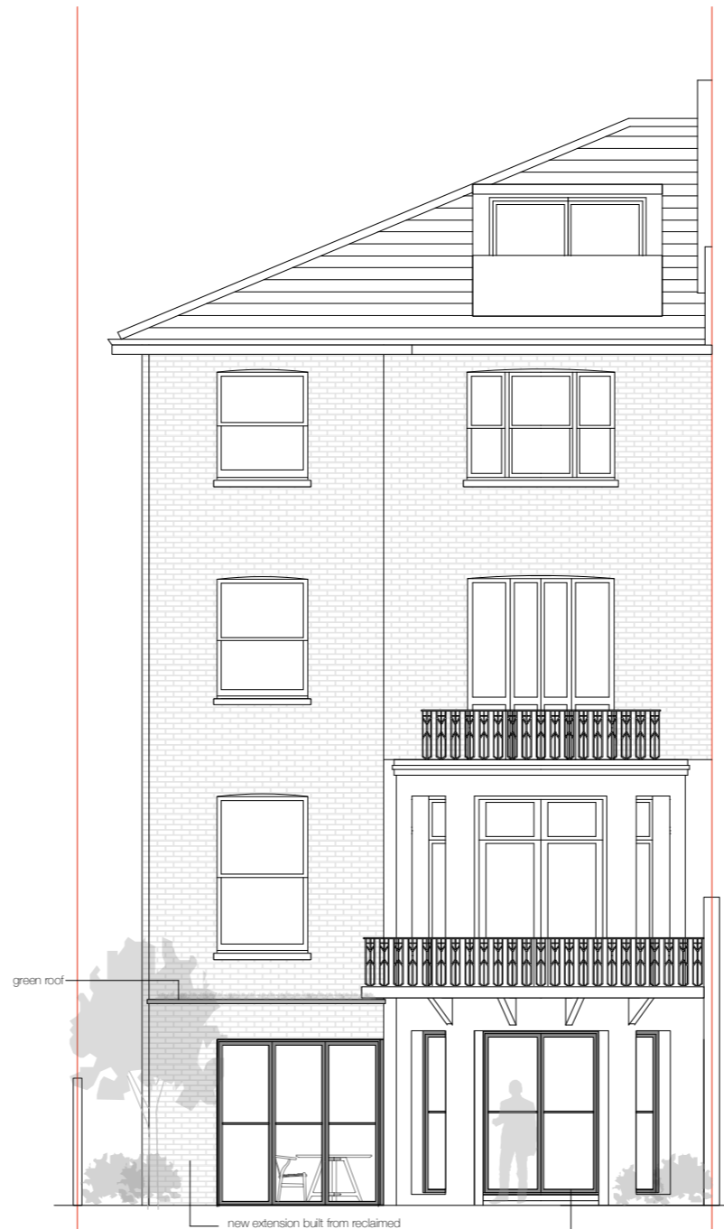
SOUTH ELEVATION - PROPOSED

extension to be demolished and elevation of bay restored