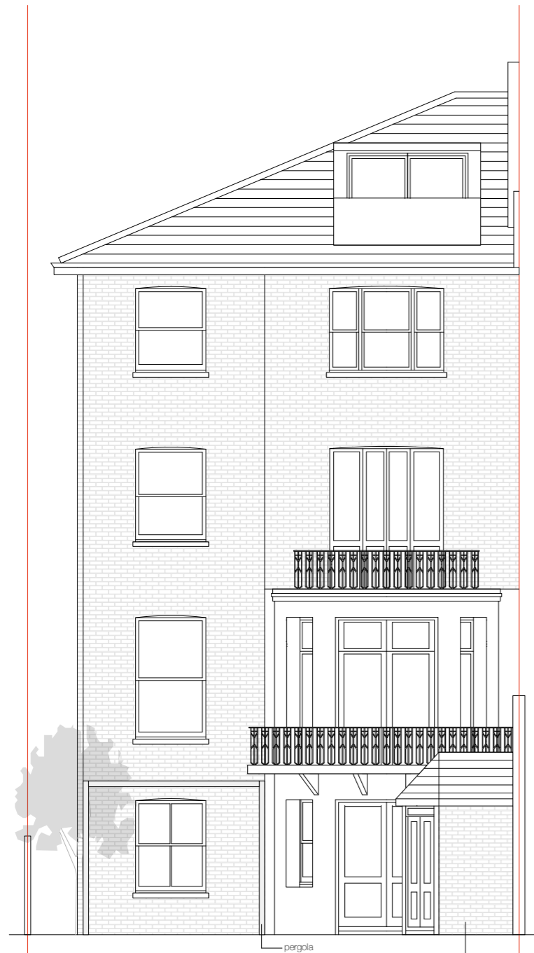
SOUTH ELEVATION - EXISTING

extension to be demolished and elevation of bay restored