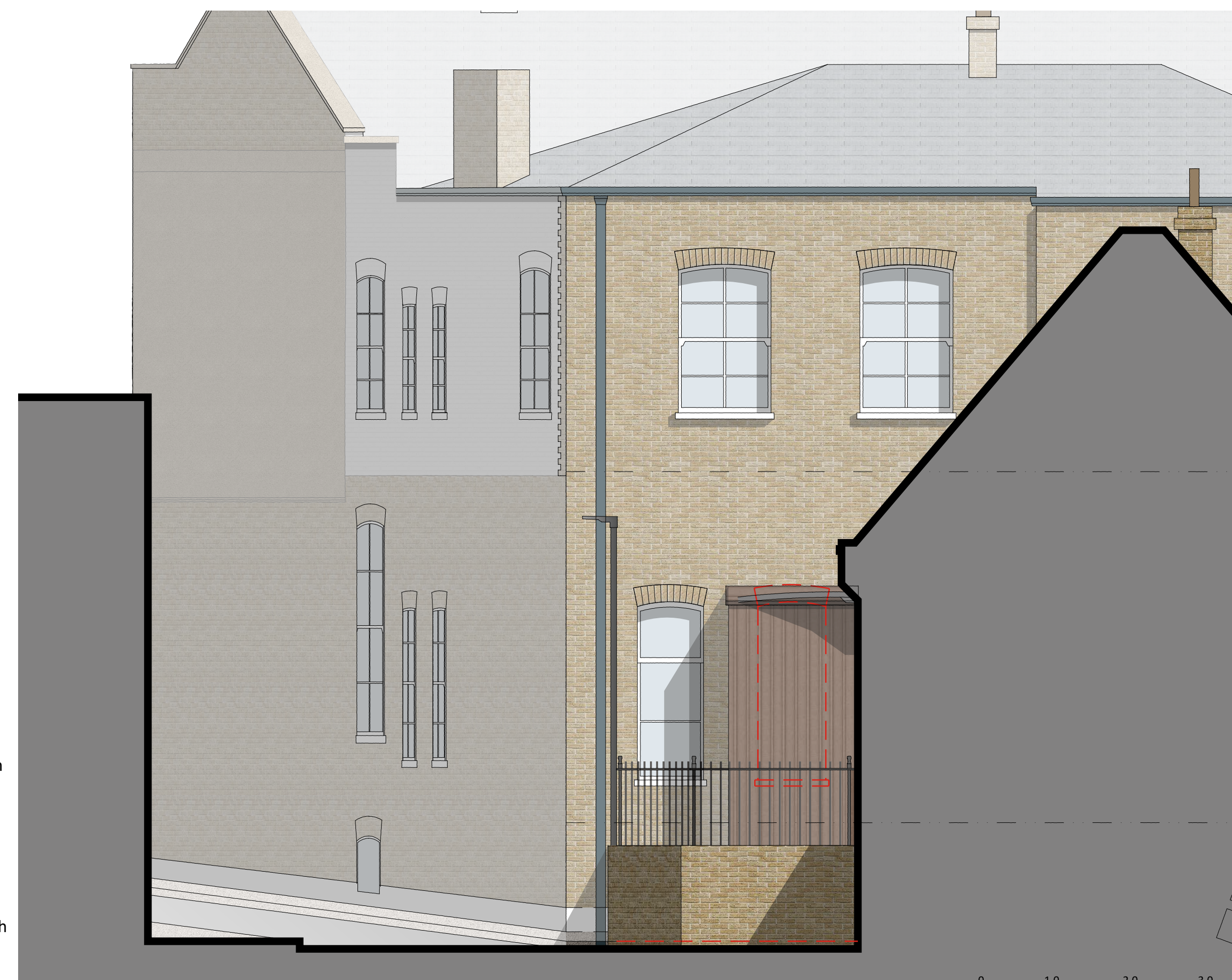
ELEVATION B AS PROPOSED