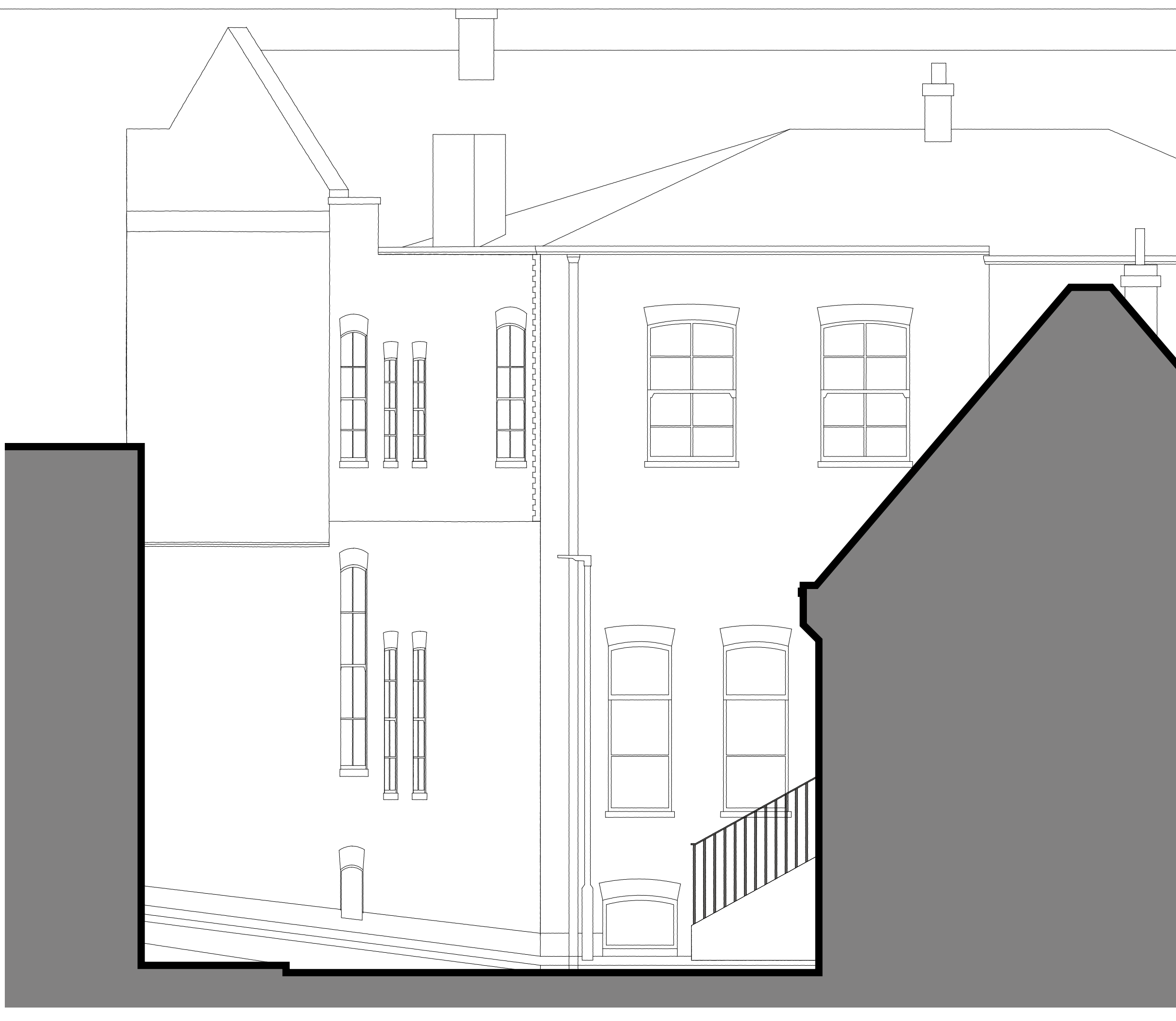
ELEVATION B AS EXISTING