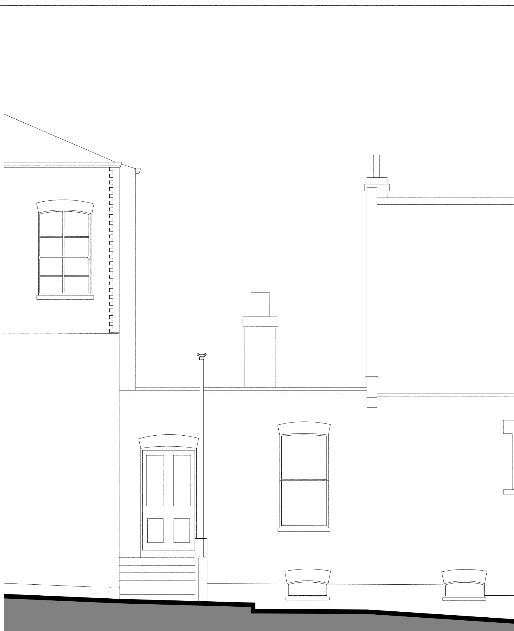
ELEVATION A AS EXISTING