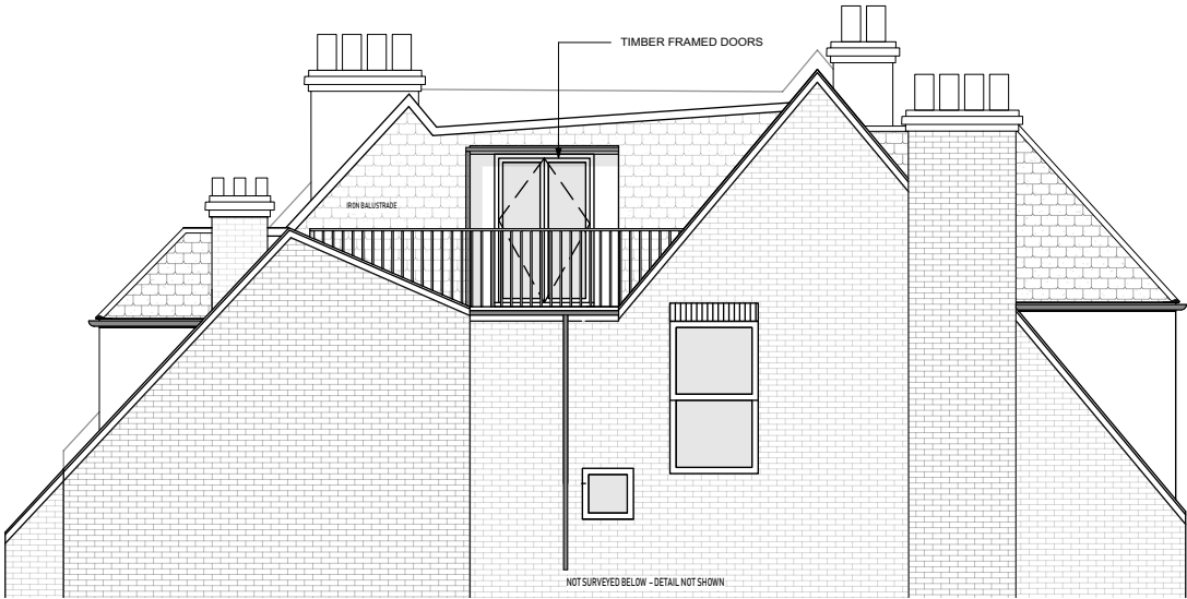
03 SIDE ELEVATION Scale: 1:100