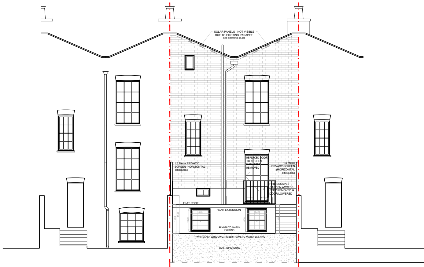
Rear Elevation (South West) 1:100