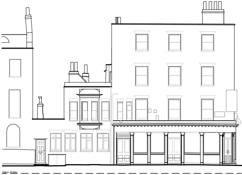
Existing North West Elevation

GENERAL NOTES: 1. THIS DRAWING IS TO BE READ IN CONJUNCTION WITH THE OTHER RELEVANT CONSULTANTS DRAWINGS. 2. ALL FINISHES ARE TO CONFORM TO THE CURRENT BUILDING REGULATIONS. 3. REFER TO A SEPARATE DOCUMENT FOR THE DESIGNERS RISK ASSESSMENT. 4. ALL WORKS OR MATERIALS INDICATED ON THIS DRAWING ARE TO BE TO THE LATEST RELEVANT BRITISH STANDARDS AND CARRIED OUT IN ACCORDANCE WITH THE BRITISH STANDARDS CODES OF PRACTICE OR RECOGNIZED INSTITUTE OR TRADE ASSOCIATION RECOMMENDATIONS AND PUBLICATIONS.