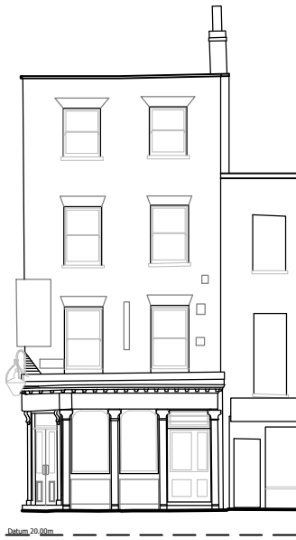
Existing South West Elevation