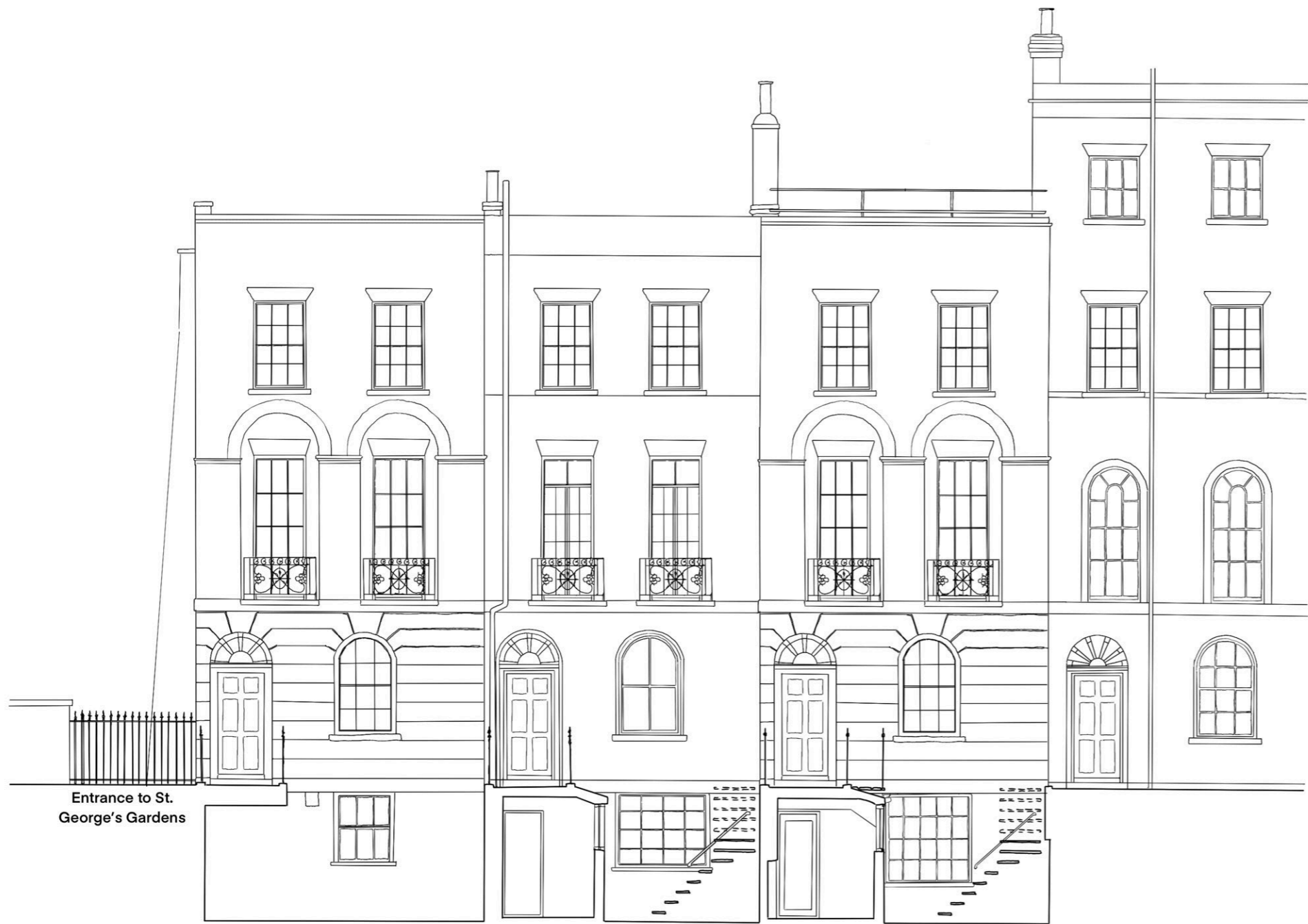
Front Elevation Proposed (No changes except for adding a vent to the roof for the kitchen)

× 51 Sidmouth Street × 53 Sidmouth Street × 55 Sidmouth street × 1 Regents Square ×