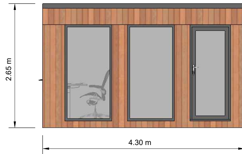
PROPOSED FRONT South East