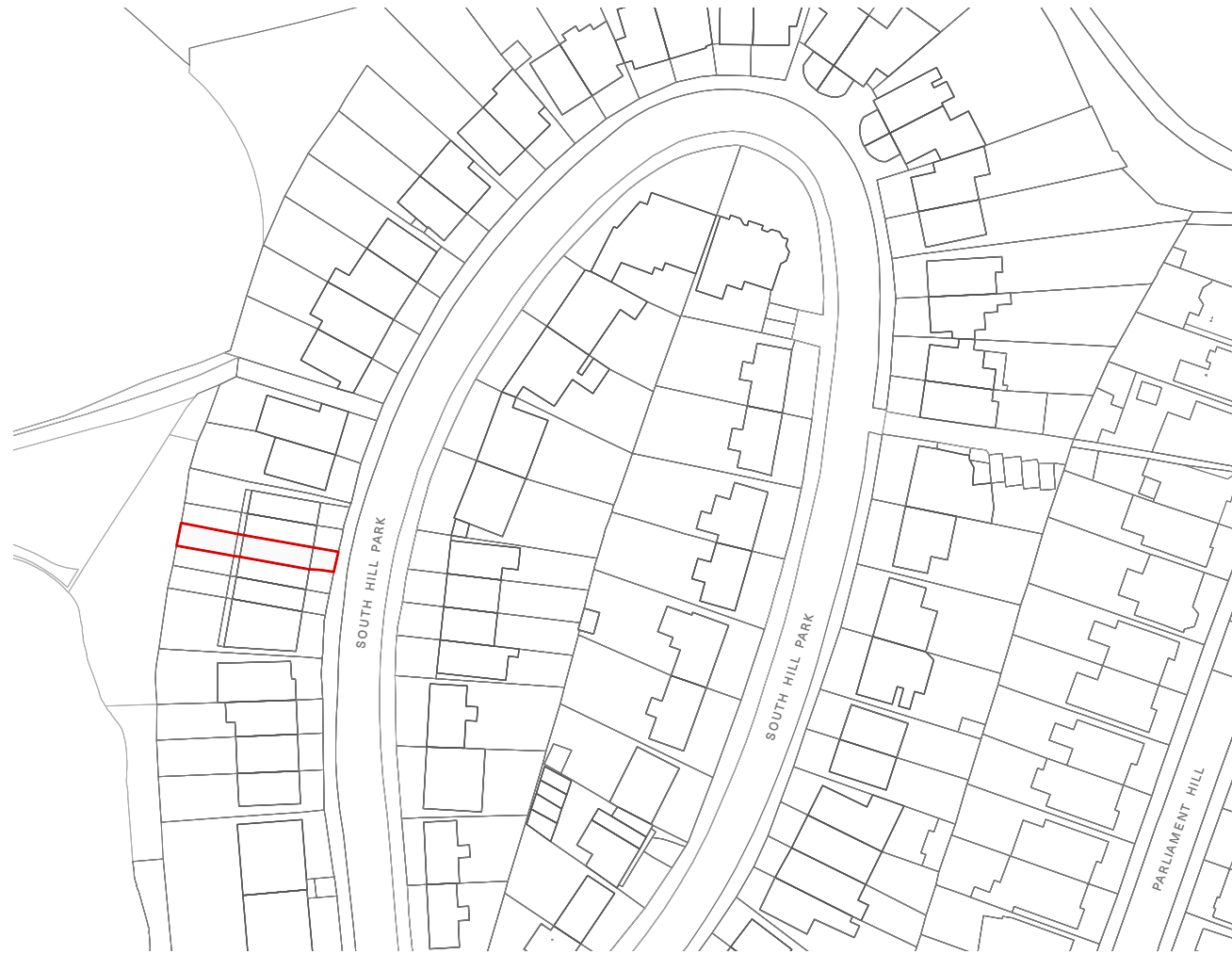
Site Location Plan 1:1250