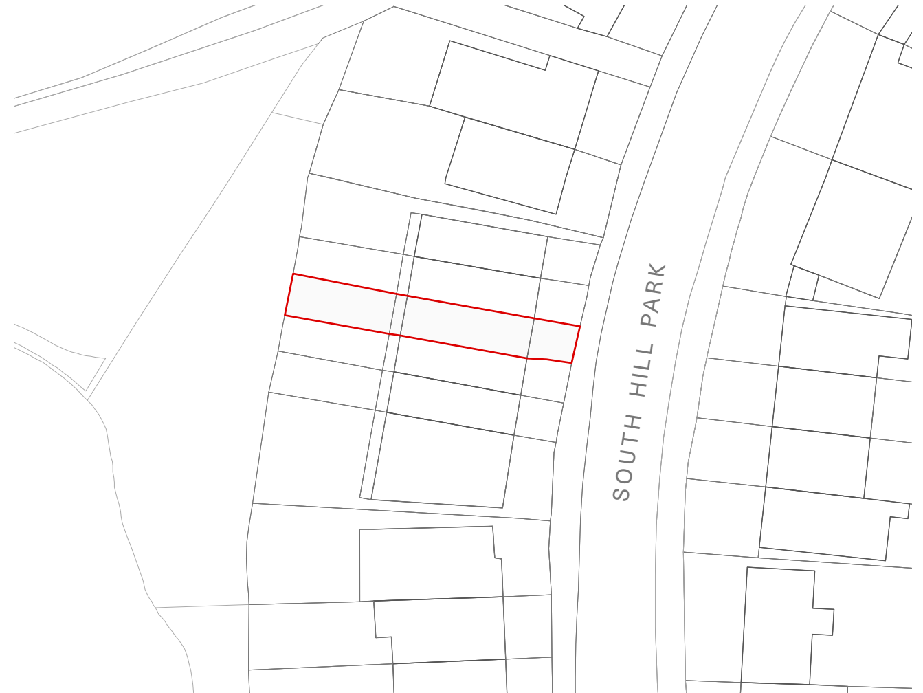
Site Block Plan 1:500