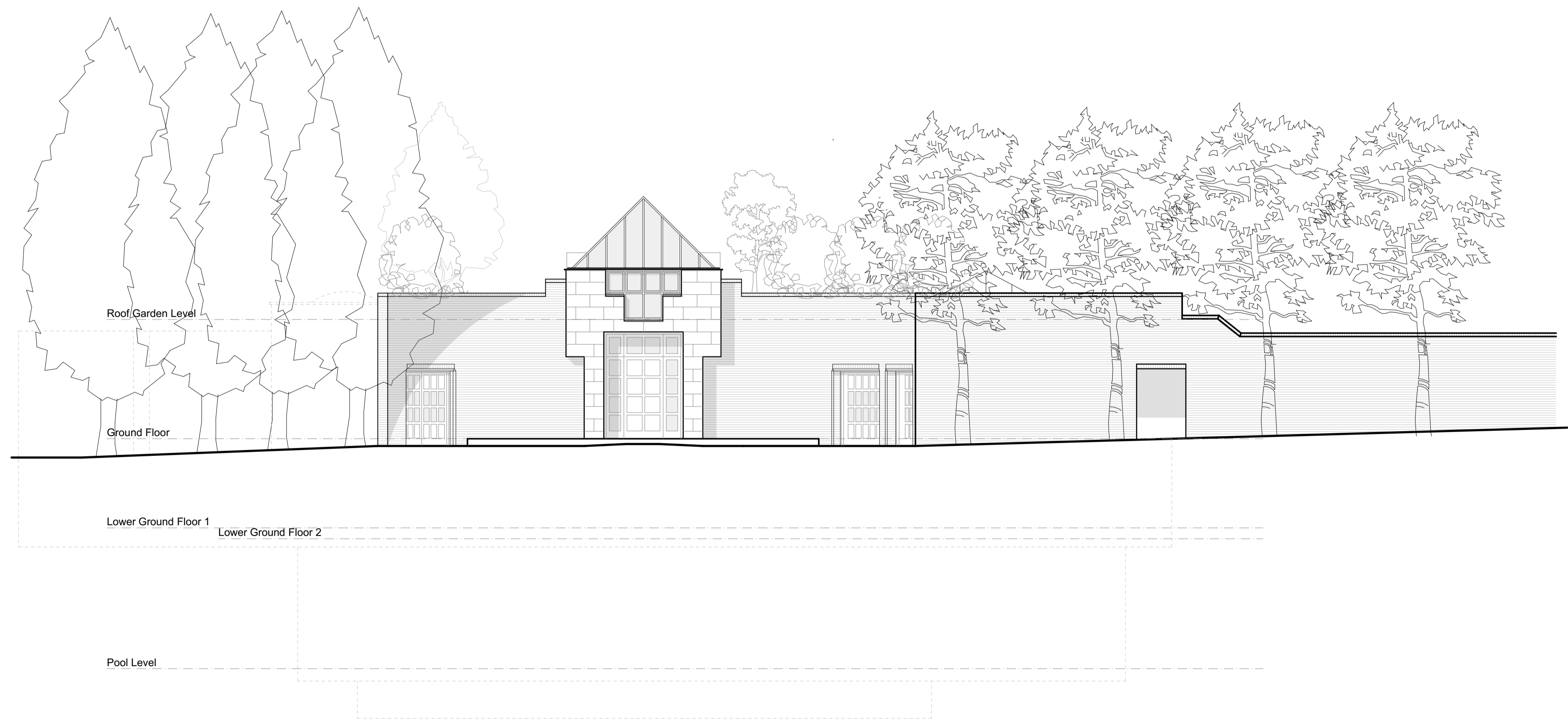
02 Existing North-East Elevation