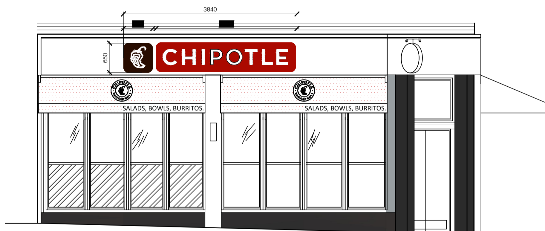
Existing Ground Floor: Elevation A Scale 1:50