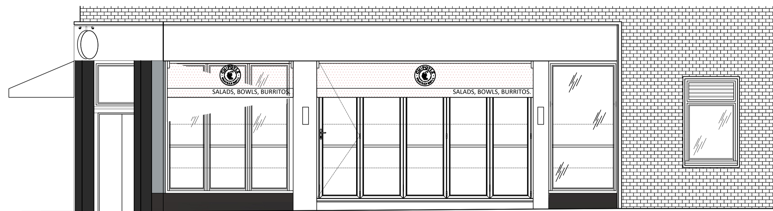
Existing Ground Floor: Elevation B Scale 1:50