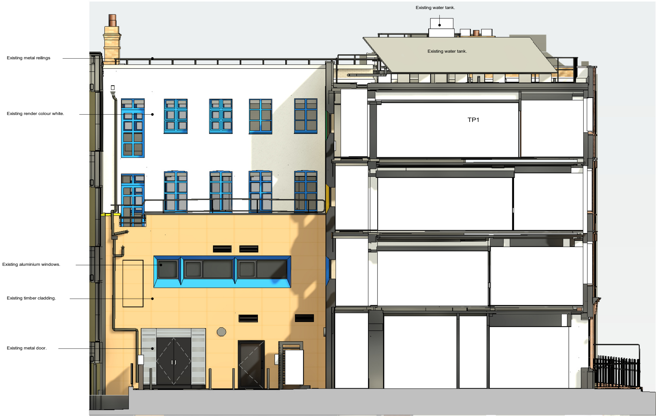
Existing West Elevation

NOTE: Design information based on the measure building survey measured by Terra Measurement Limited, received on 13.03.23. FFL varies across the building.