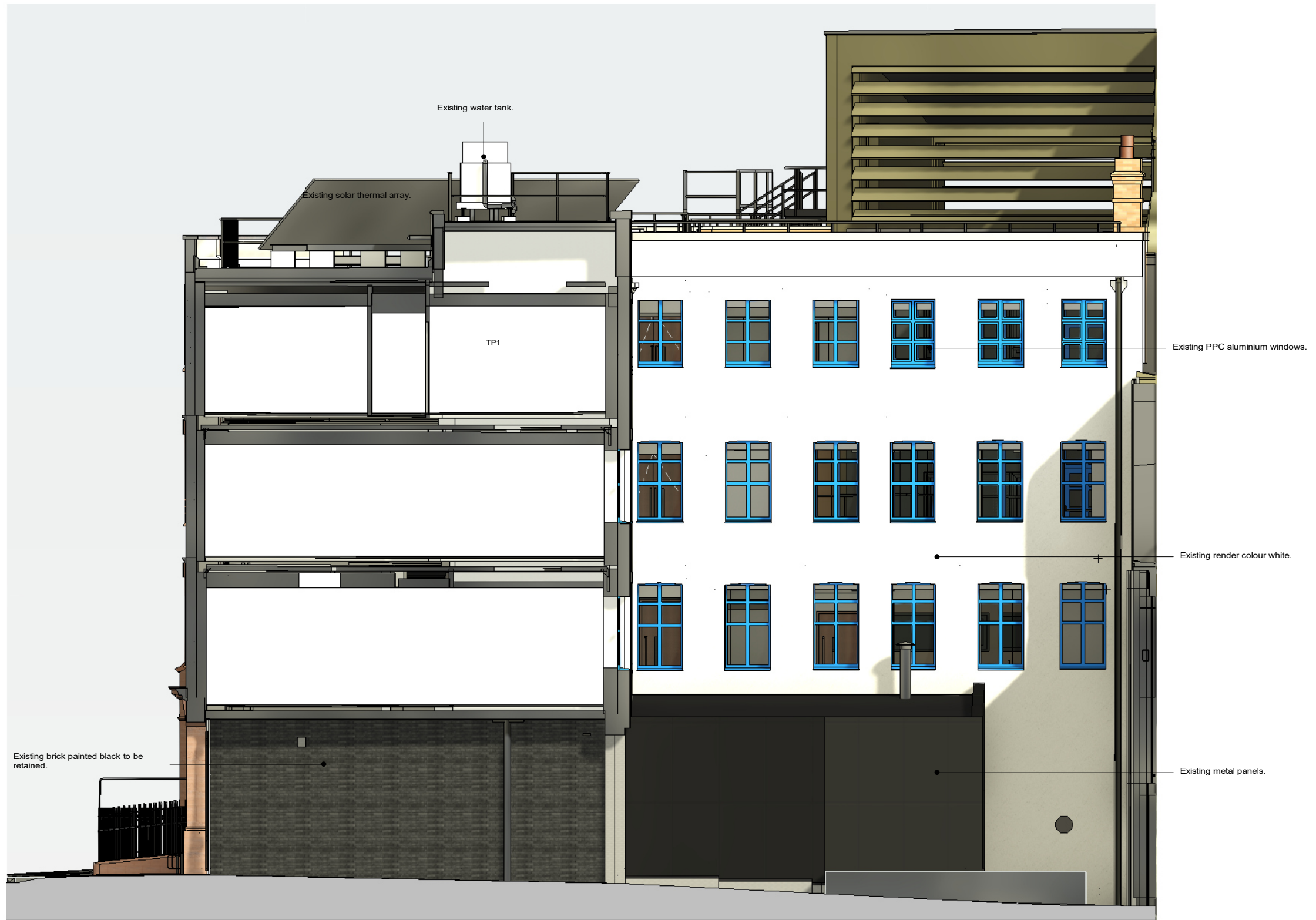
Existing East Elevation