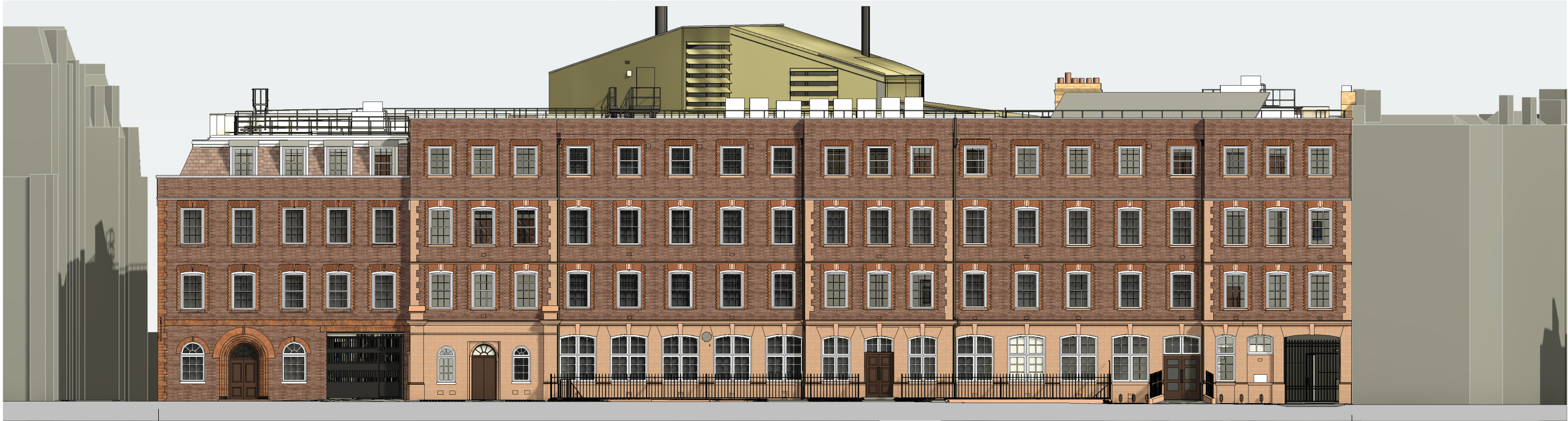
LSHTM TP1 Tavistock 15-17