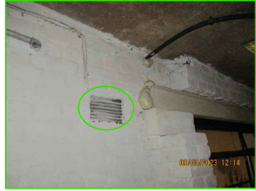
Existing vent re-furbished to provide passive ventilation by fresh external air