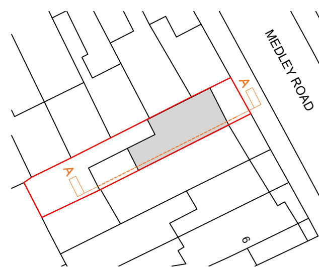
+SP Reference Plan - scale 1:500 at A3