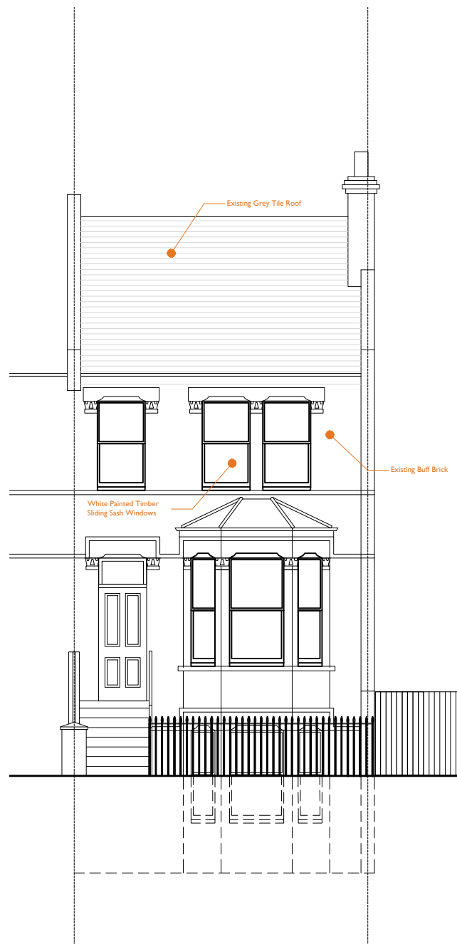
+EL Existing East elevation - scale 1:100 at A3 Scale in Metres