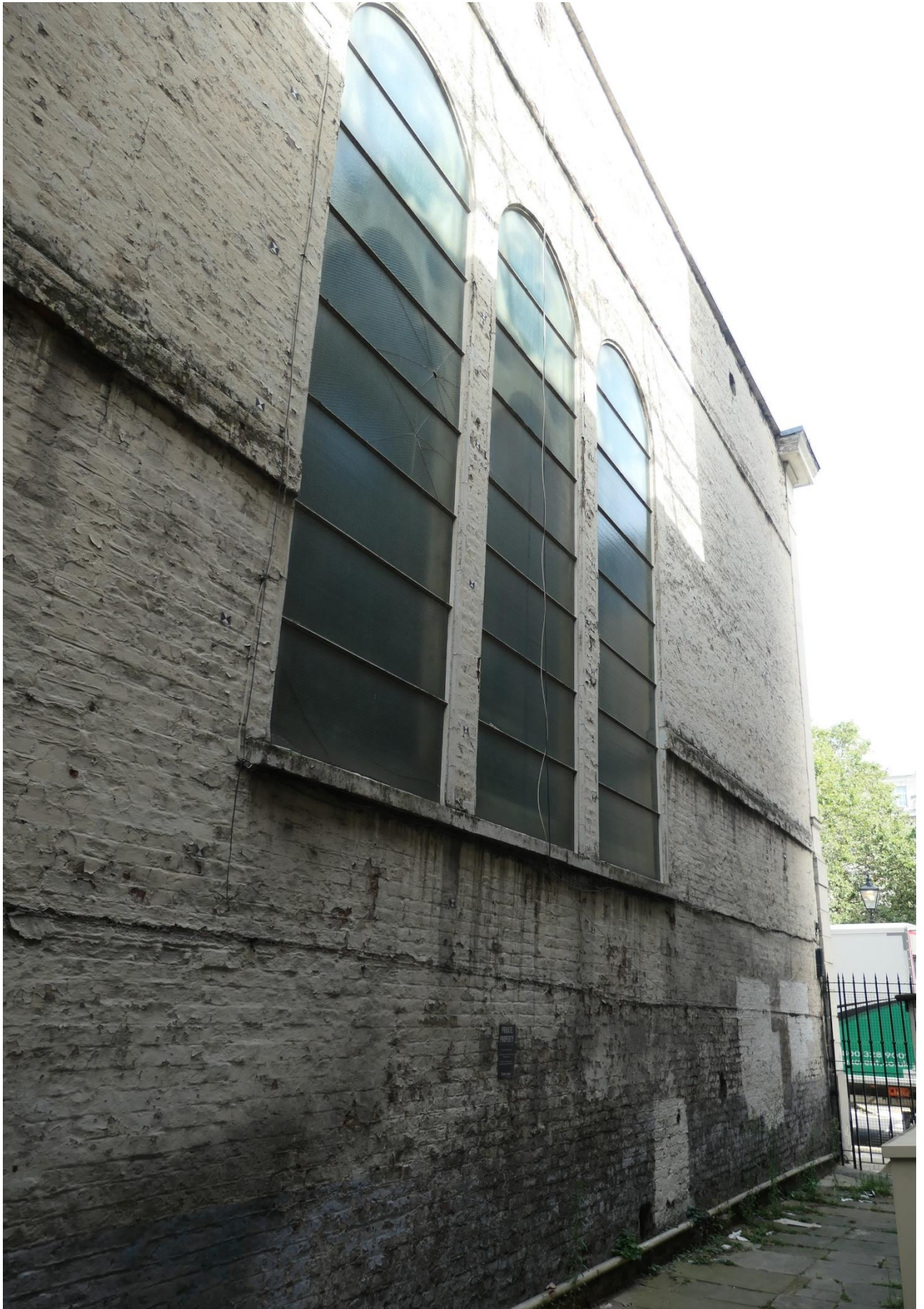
Photo 1: The facing elevation of the church is separated from the subject building by a narrow, poor quality alleyway, and this south facing elevation of the church is largely absent of decorative features.