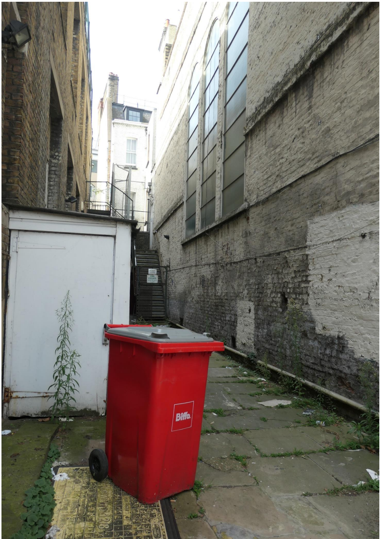
Photo 2: The facing elevation of the church is separated from the subject building by a narrow, poor quality alleyway, and this south facing elevation of the church is largely absent of decorative features.