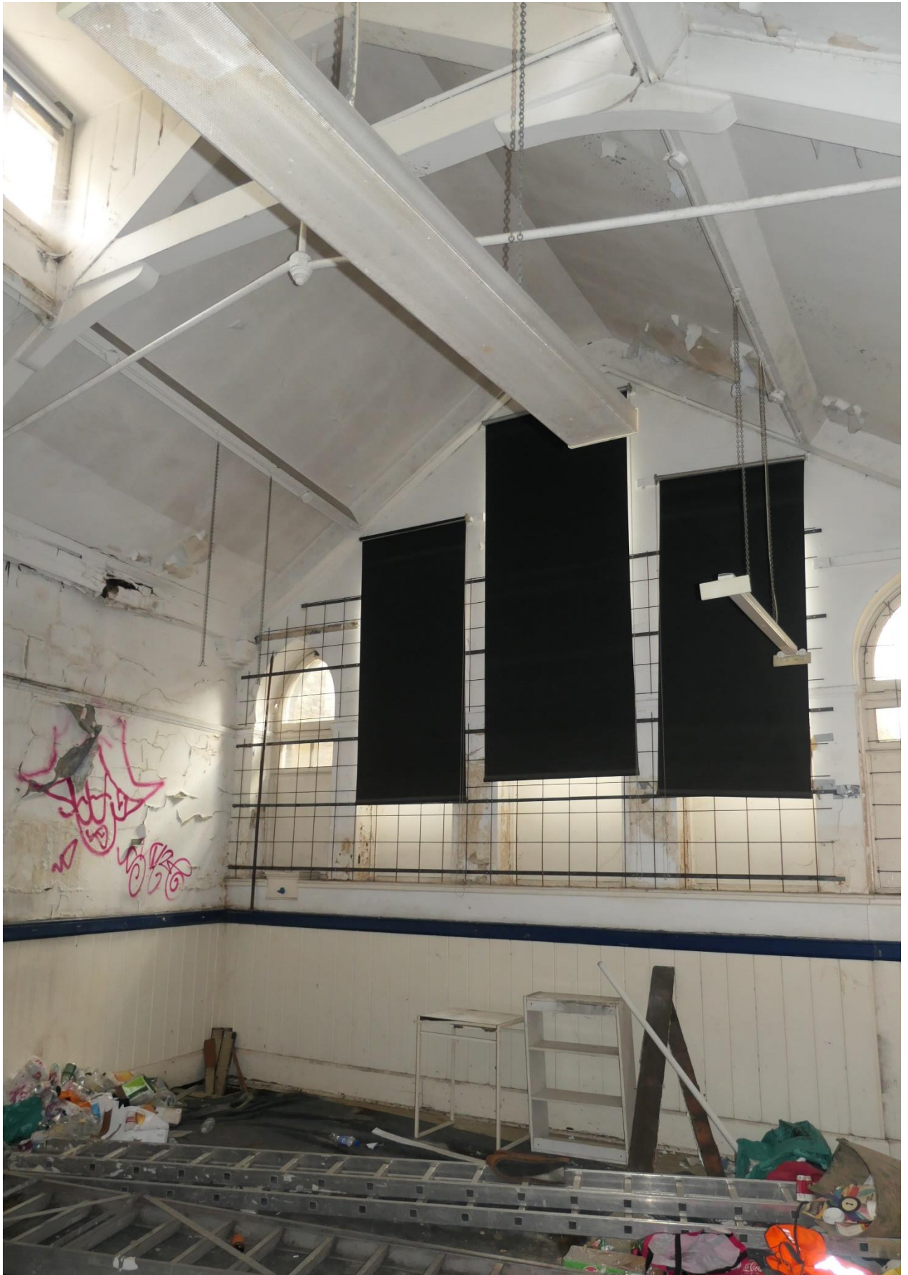
Photo 12: The smaller, gabled cross-wing at the back of the ground floor.