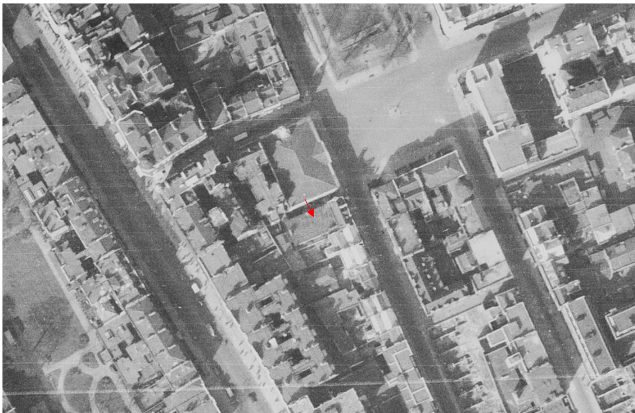
Fig 1: An extract of a 1946 aerial photo, showing the subject building with a red arrow. RAF_3G_TUD_UK_112_VP3_5229