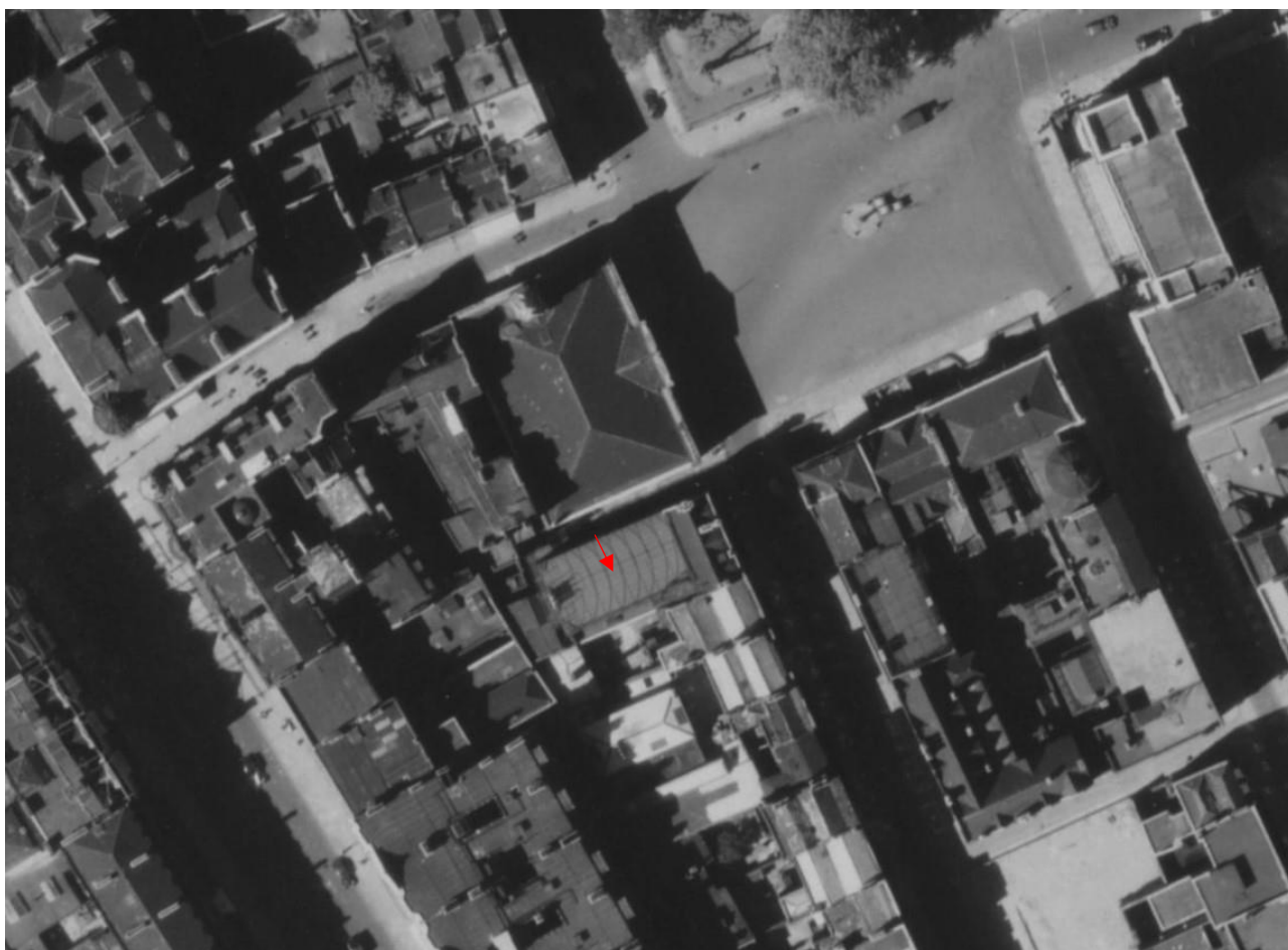
Fig 2: An extract of a 1948 aerial photo, showing the subject building with a red arrow. © Historic England RAF_58_44_VP1_5057