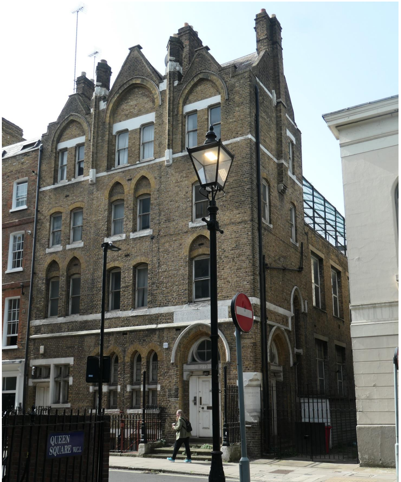
Photo 4: The frontage block of the subject building, seen obliquely from Queen Square.