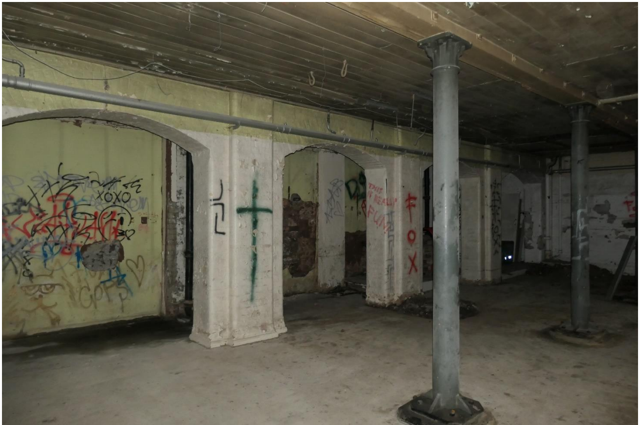
Photo 8: The cast iron columns and internal arcade in the basement rear room are of C19 character and likely to be original.