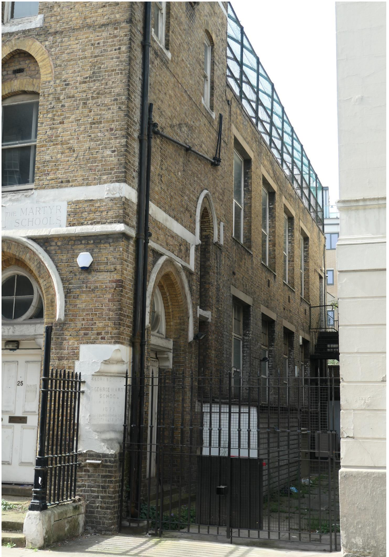
Photo 3: The proposed external changes are located at the rear, and would replace a very unsightly steel and wire cage at the top of the building.