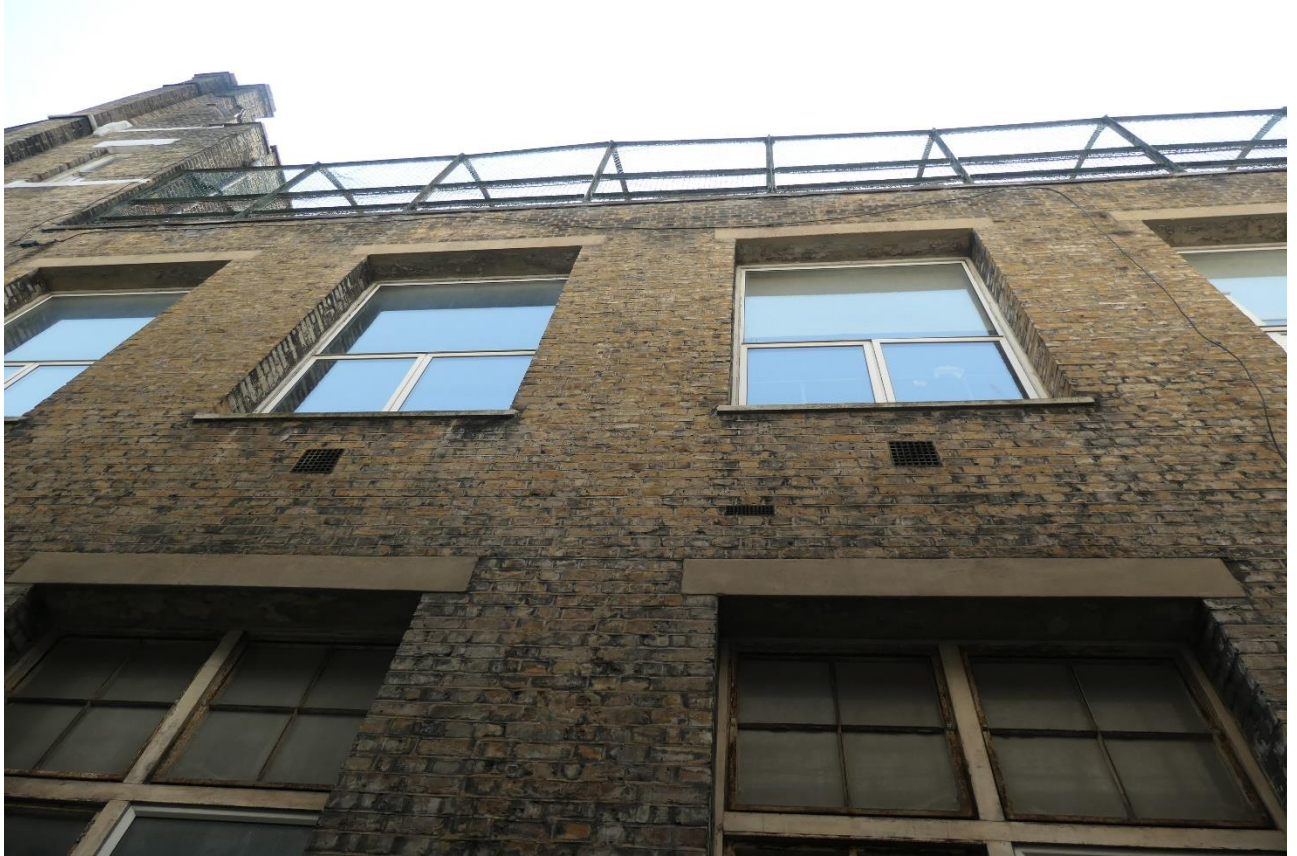
Photo 6: The upper part of the rear extension, seen from the alleyway to the north.