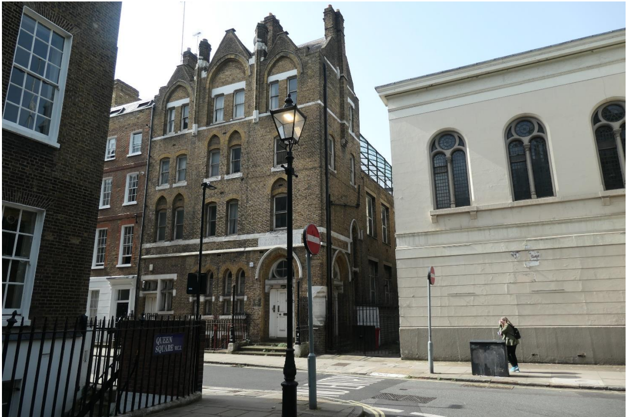
Photo 6: The frontage block and rear extension, seen obliquely from Queen Square.