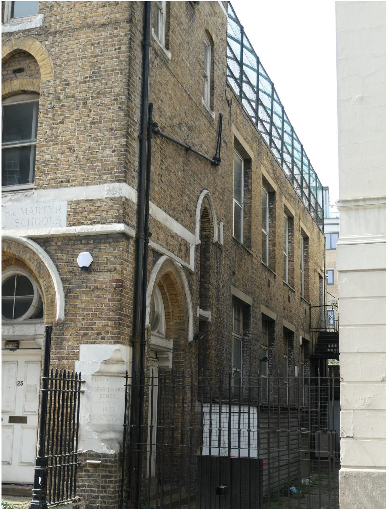
Photo 5: The frontage block and rear extension, seen obliquely from the alleyway to the north.

consistency in the fenestration, the change in brickwork visible on the north elevation, and change in interior floor levels indicate that this is a later extension to the original building, probably rebuilt over a retained basement structure.