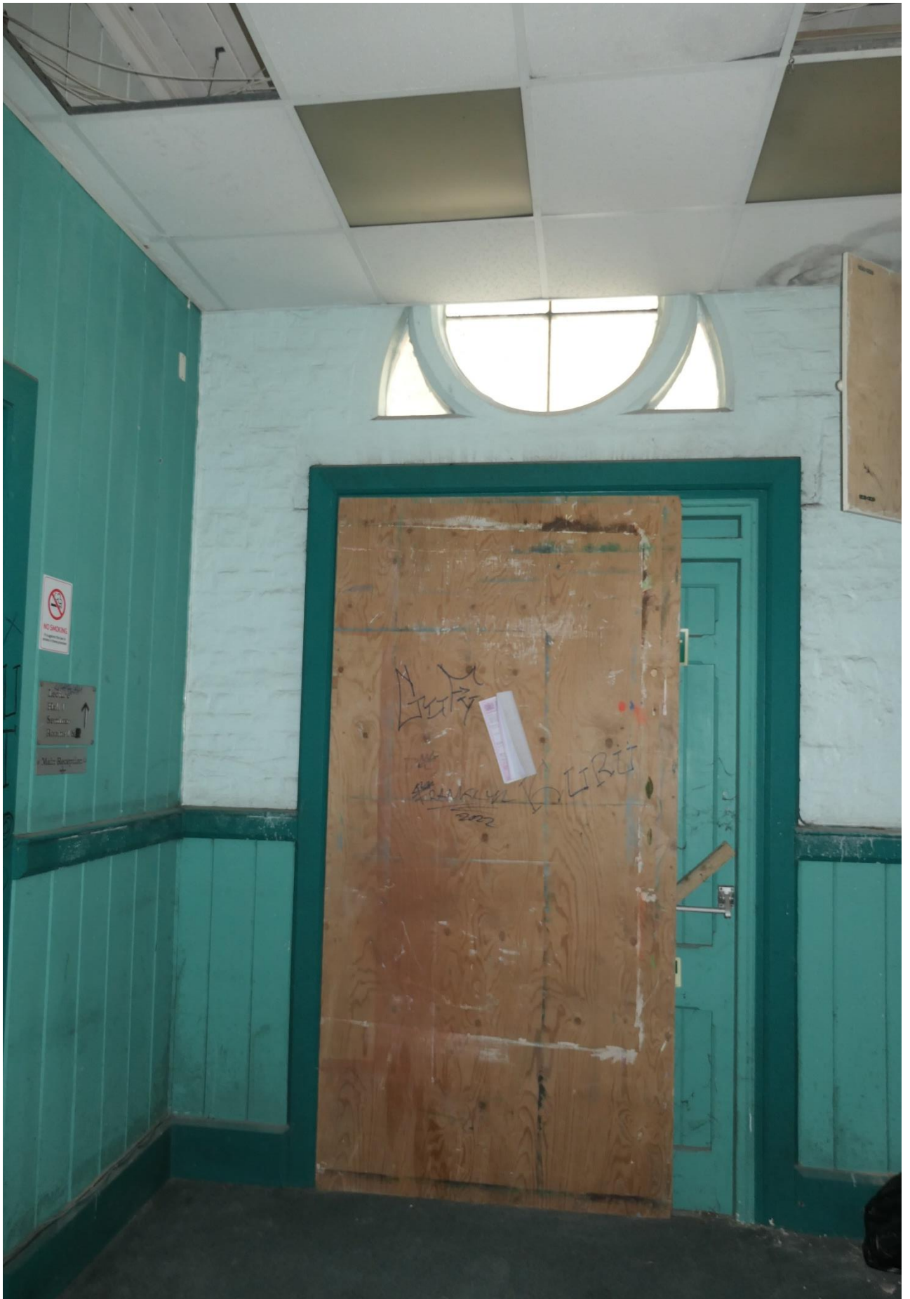
Photo10: The ground floor entrance hall.