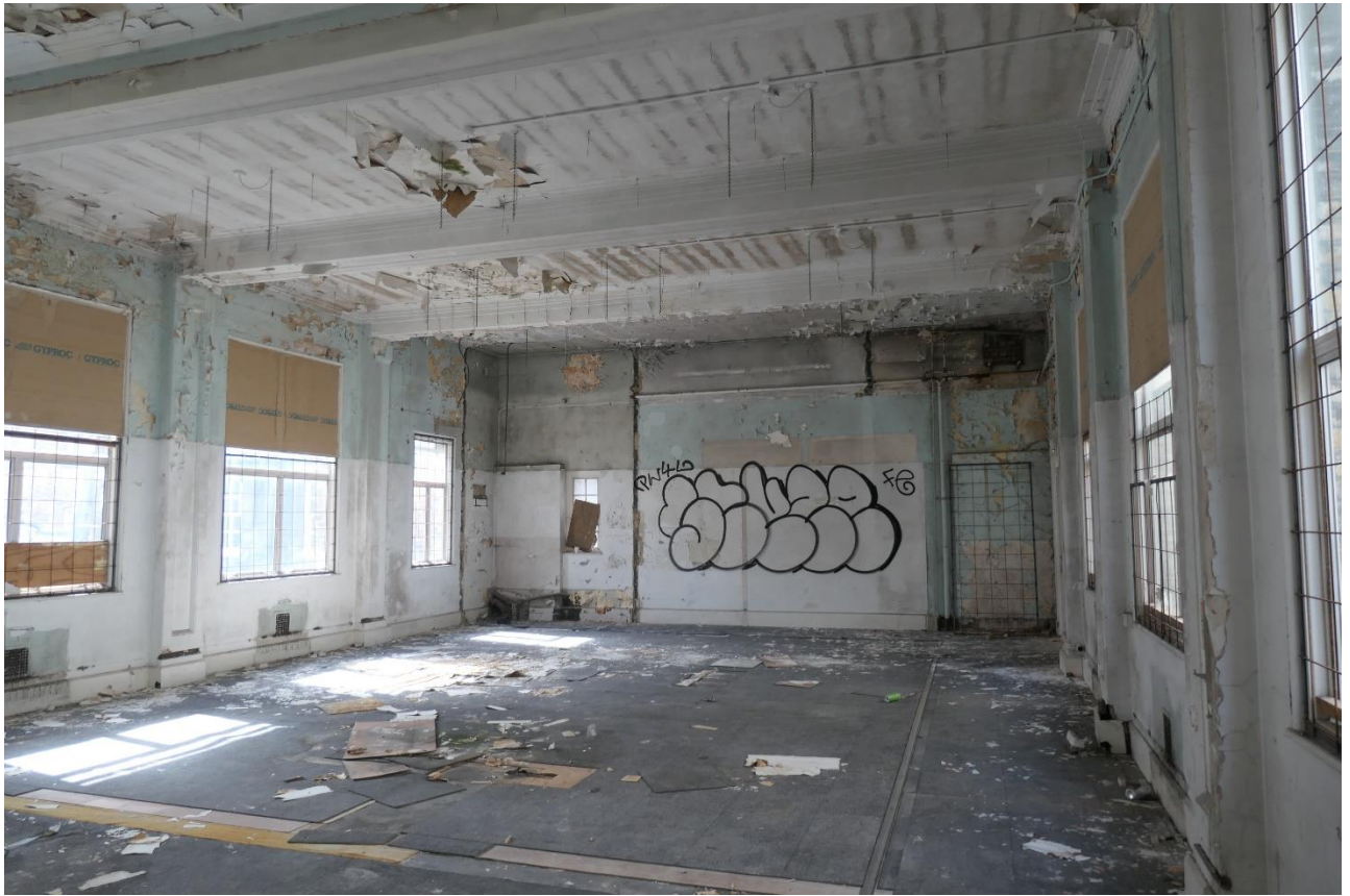
Photo 13: The later inserted first floor has no features of interest.