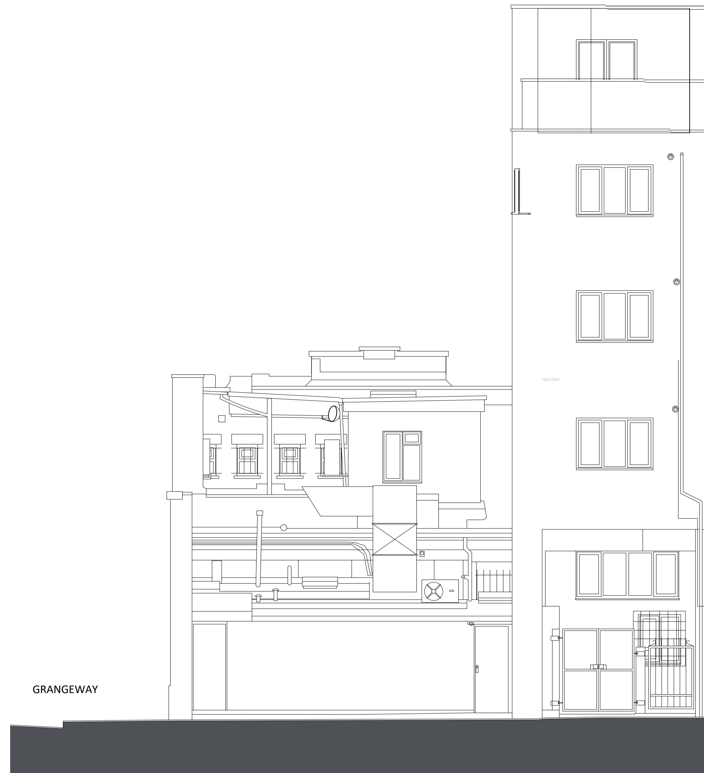
1 Existing East Elevation 1 : 50 @ A1 / 1:100 @ A3