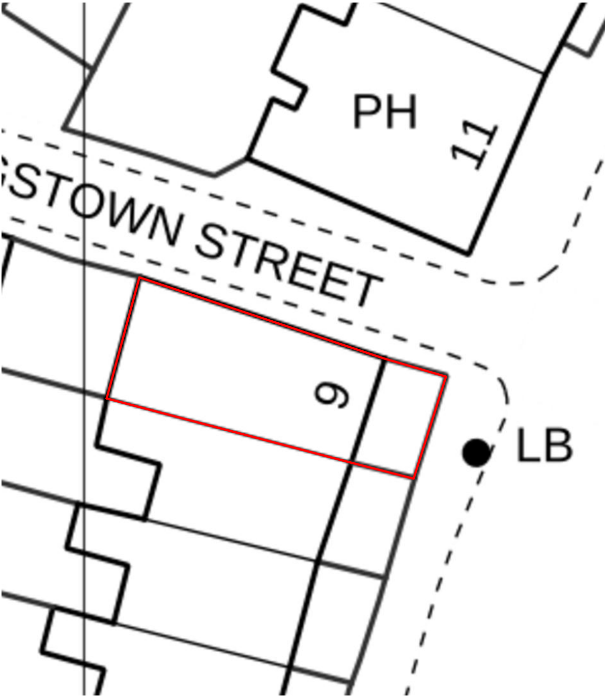
02 Block Plan scale: 1:200