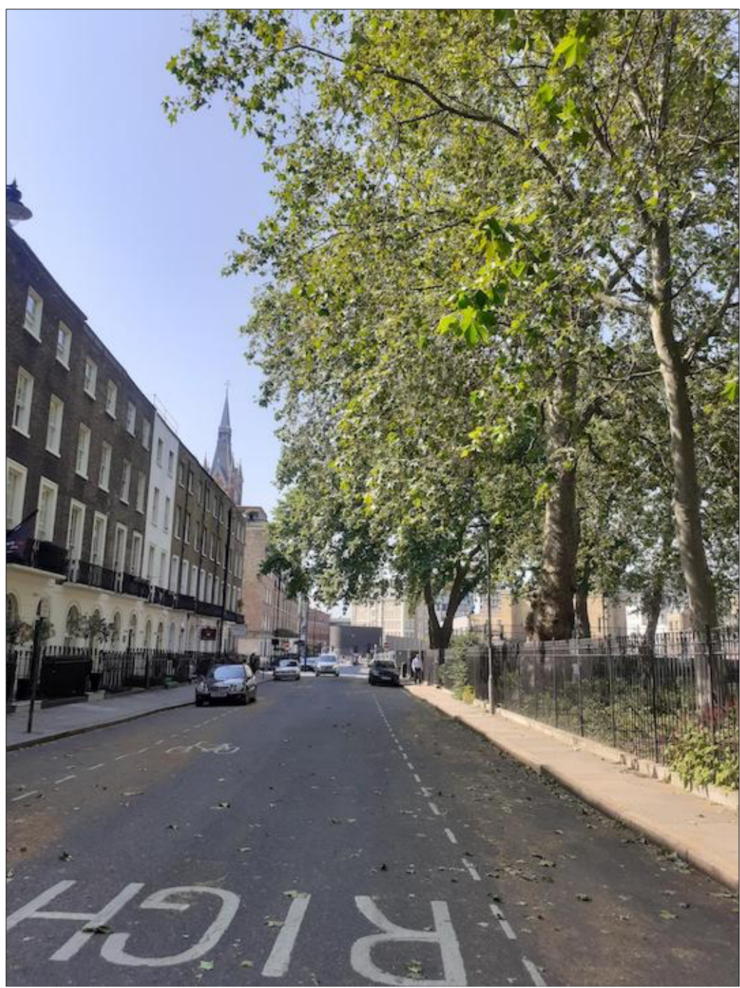
Photograph 1. Cabin location on Argyle Square viewed from south looking north.