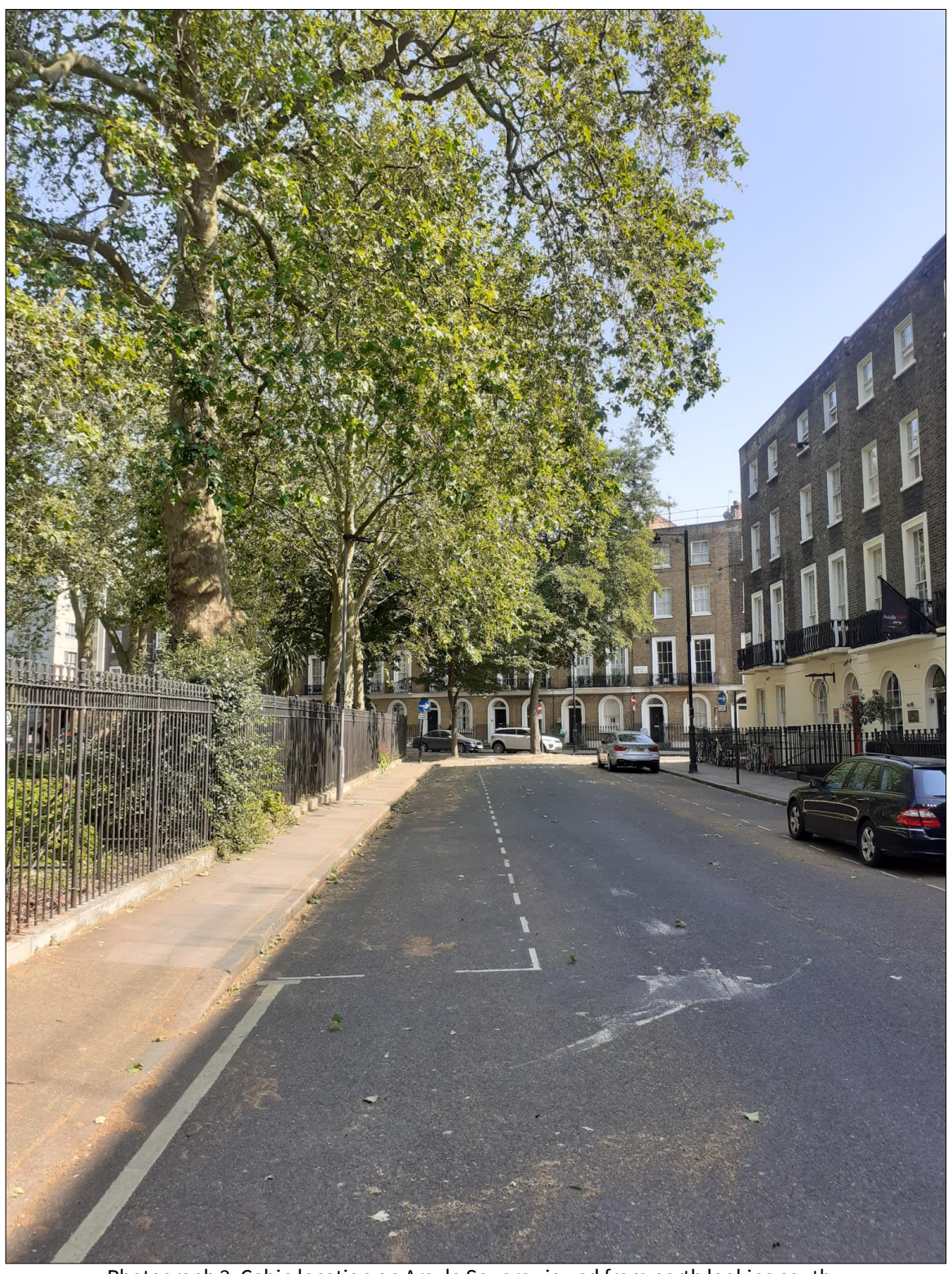
Photograph 2. Cabin location on Argyle Square viewed from north looking south.