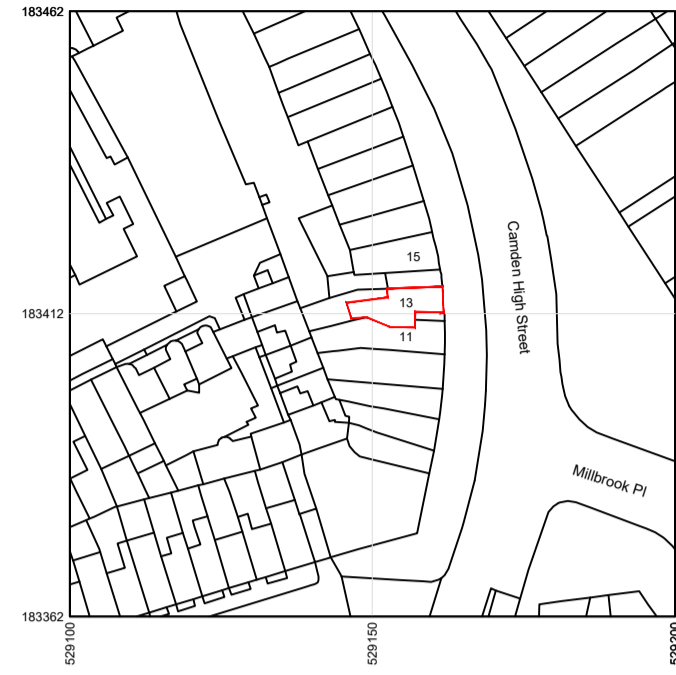
SITE LOCATION Scale 1:1250