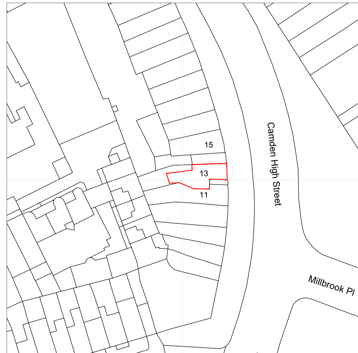
SITE LOCATION Scale 1:500