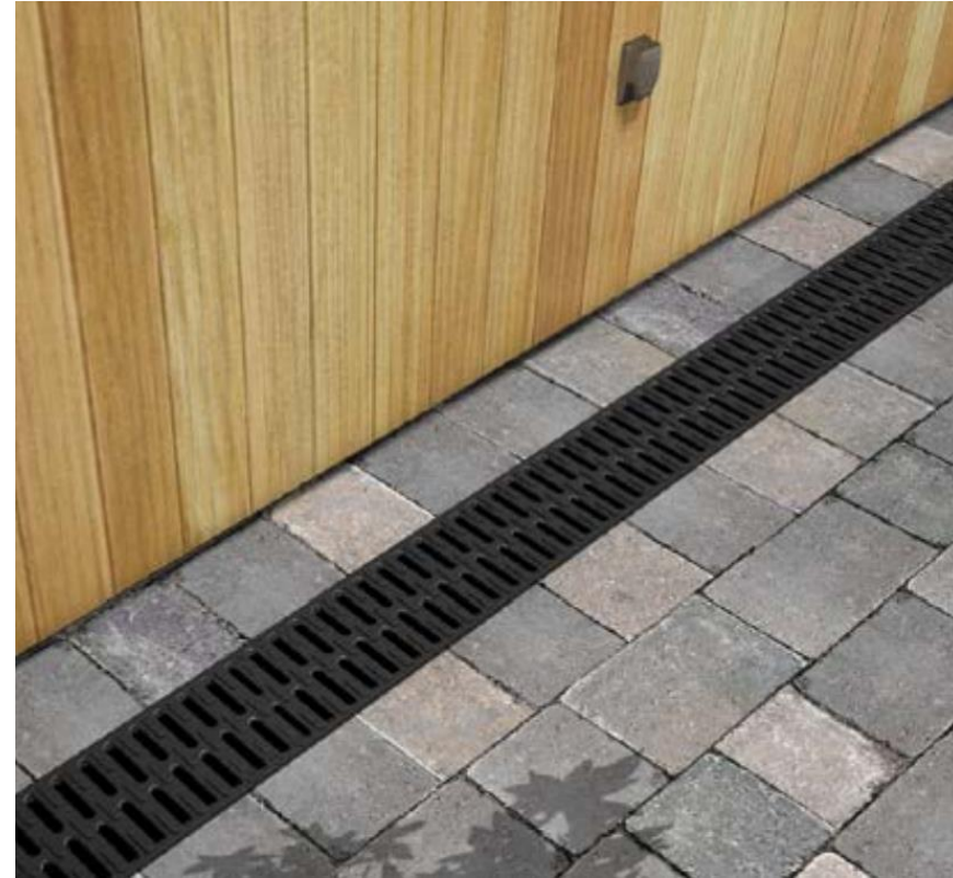
Photograph showing Aco Drain system to be used – plan reference note on legend: G