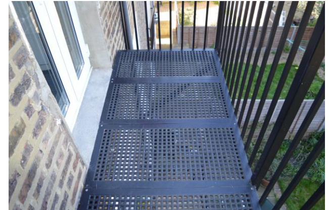
Photograph showing similar metal grate balcony flooring in powdercoated black finish – to be implemented in principle in proposed design