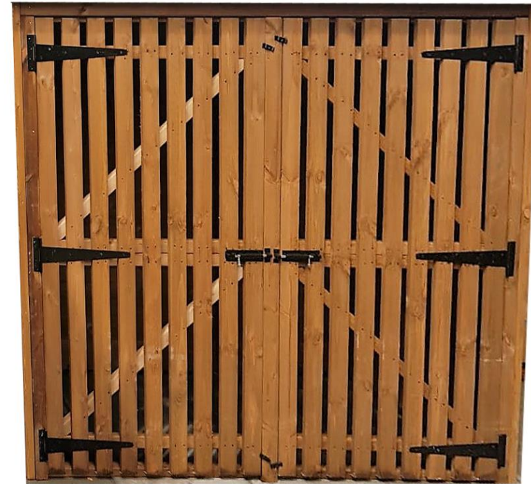
Photograph of example of bin gates – ventilated vertical timber slat design to be implemented in principle in proposed design