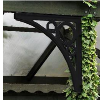
Photograph showing similar metal gallow bracket in powdercoated black finish – to be implemented in principle in proposed design