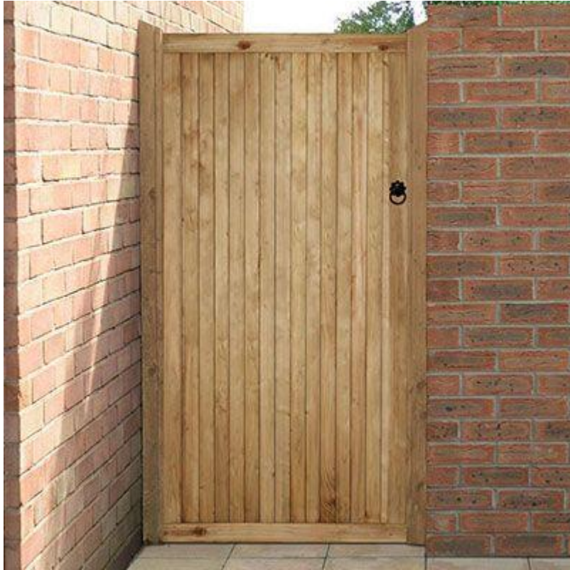
Photograph showing similar secured timber side gate to be implemented in principle in proposed design