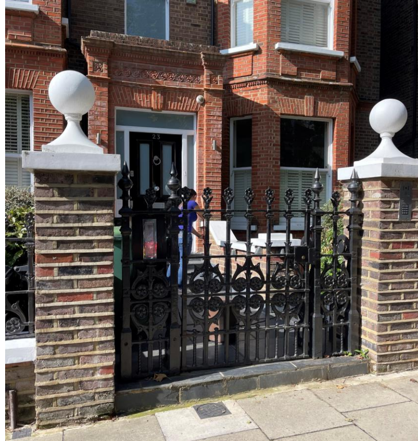
Photograph of neighbouring iron wrought gate at 29 Netherhall Gardens to be implemented in principle in proposed design. To be used as pedestrian gate 2 design