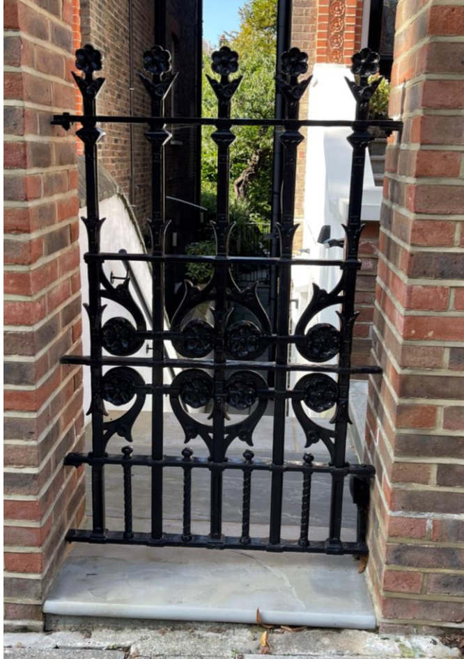
Photograph of neighbouring iron wrought gate at 29 Netherhall Gardens to be implemented in principle in proposed design. To be used as bike gate design – to match pedestrian gates 1 and 2