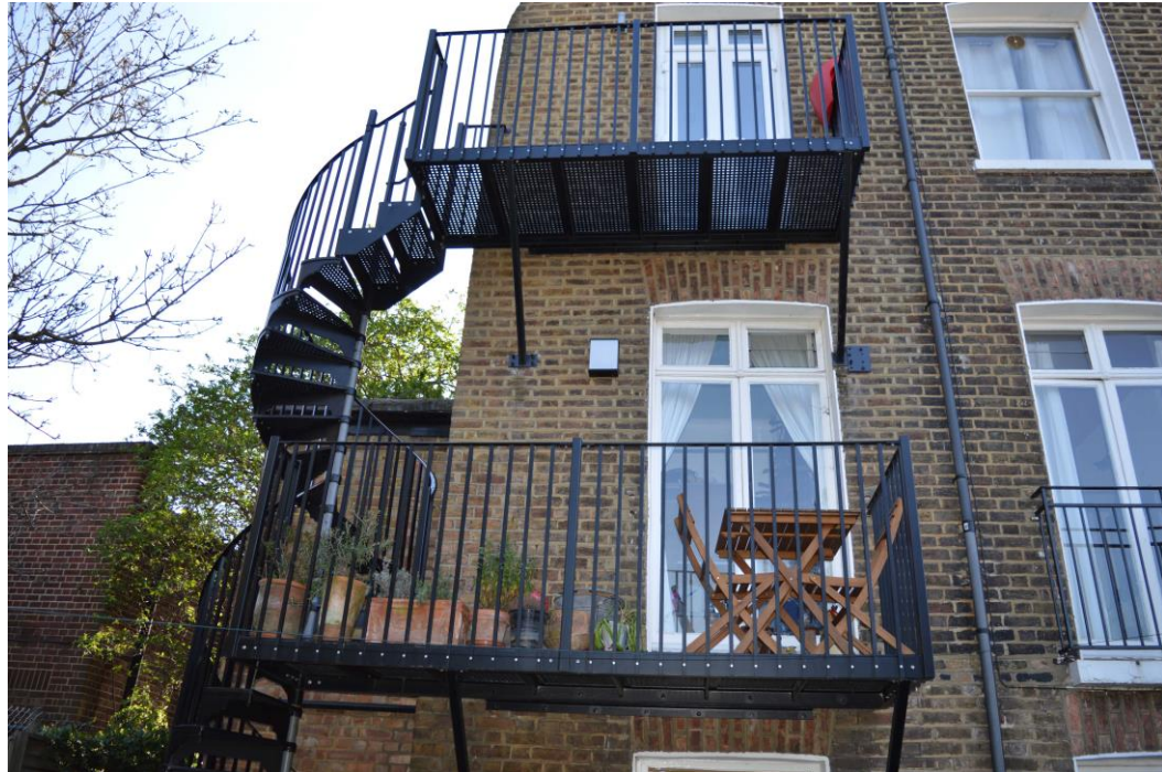
Photograph showing similar metal cantilevered balcony in powdercoated black finish – to be implemented in principle in proposed design