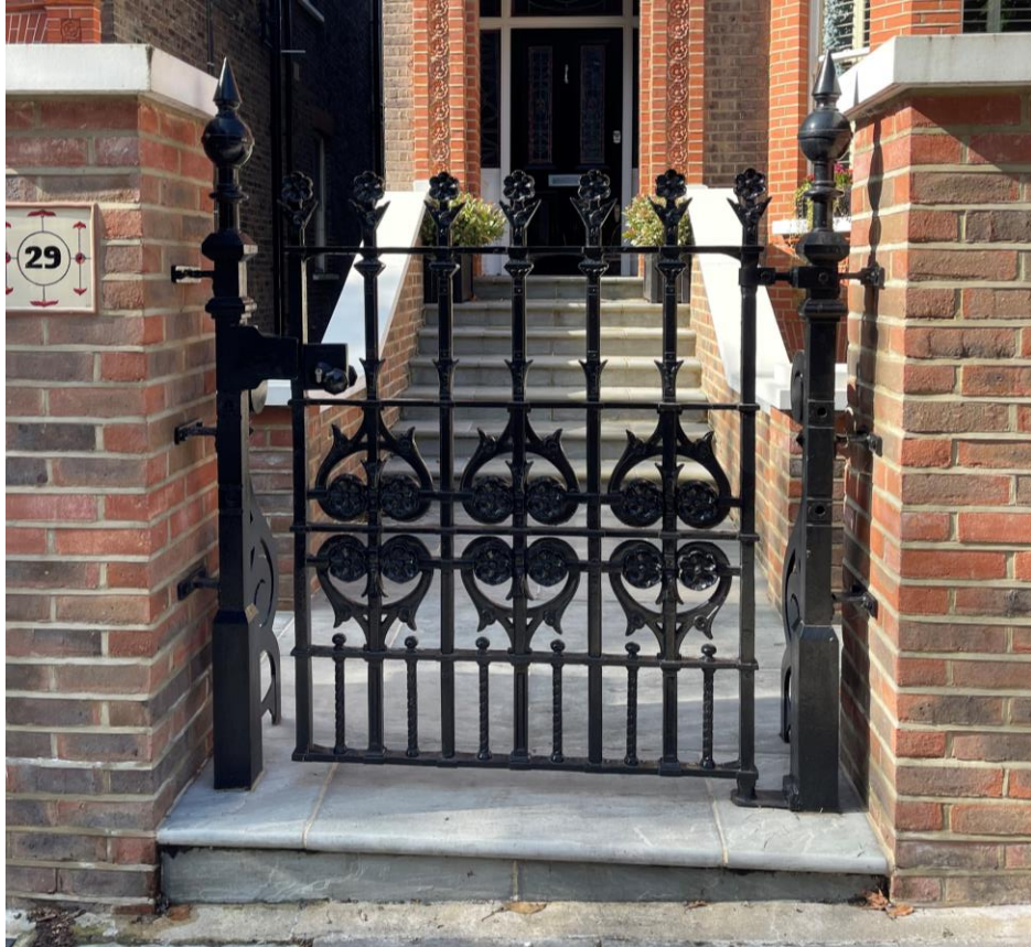
Photograph of neighbouring iron wrought gate at 29 Netherhall Gardens to be implemented in principle in proposed design. To be used as pedestrian gate 1 design