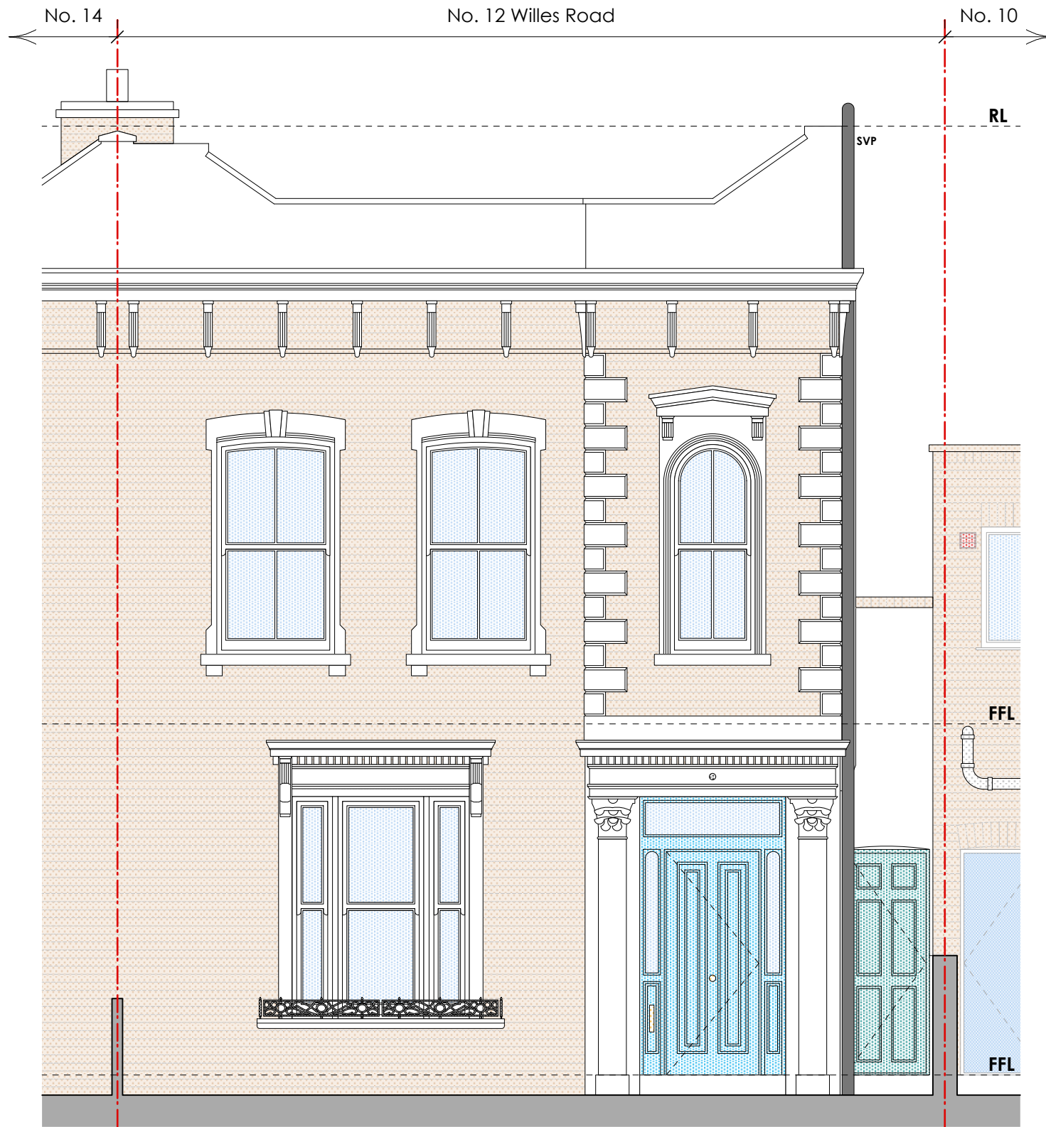
1 Existing Front Elevation scale: 1:50 @ A3