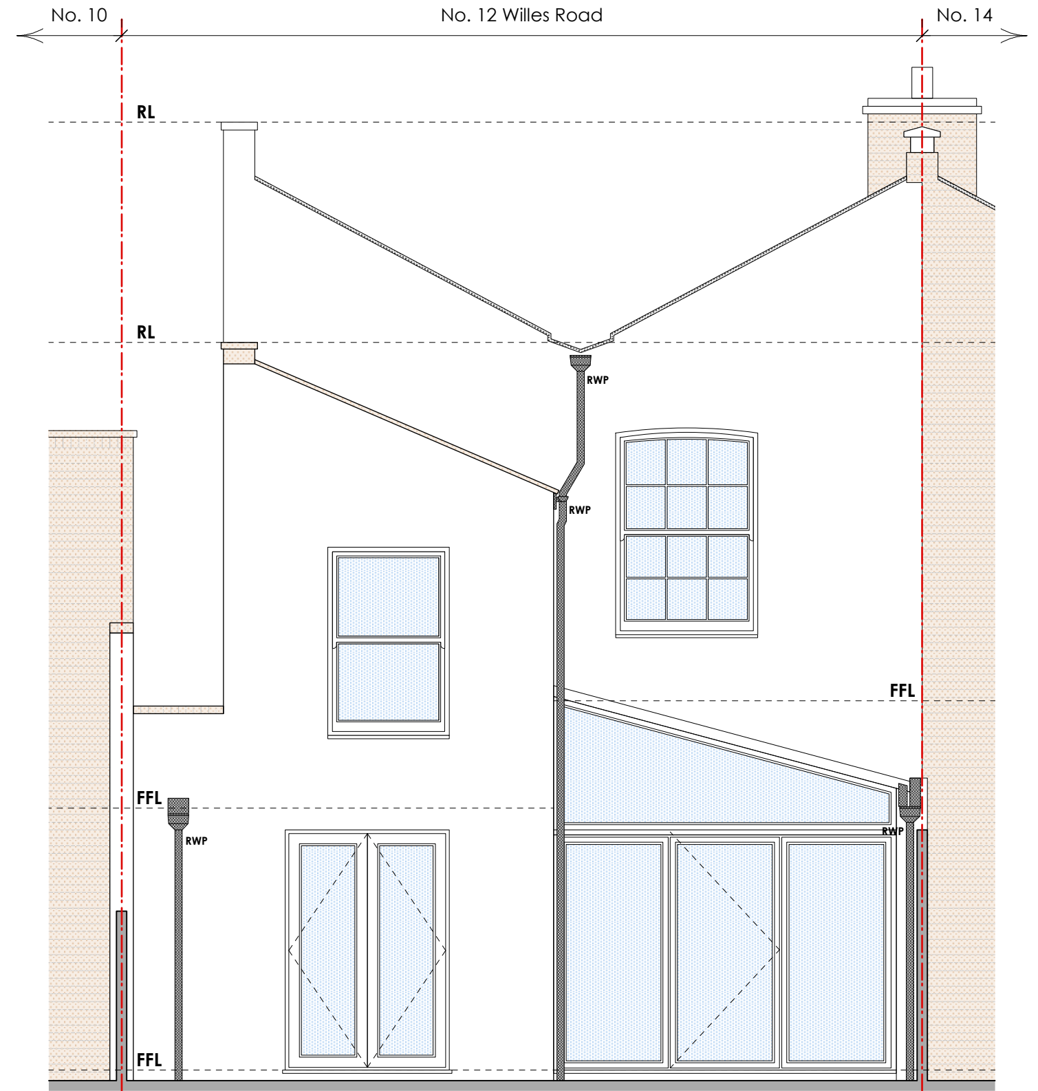
2 Existing Rear Elevation scale: 1:50 @ A3