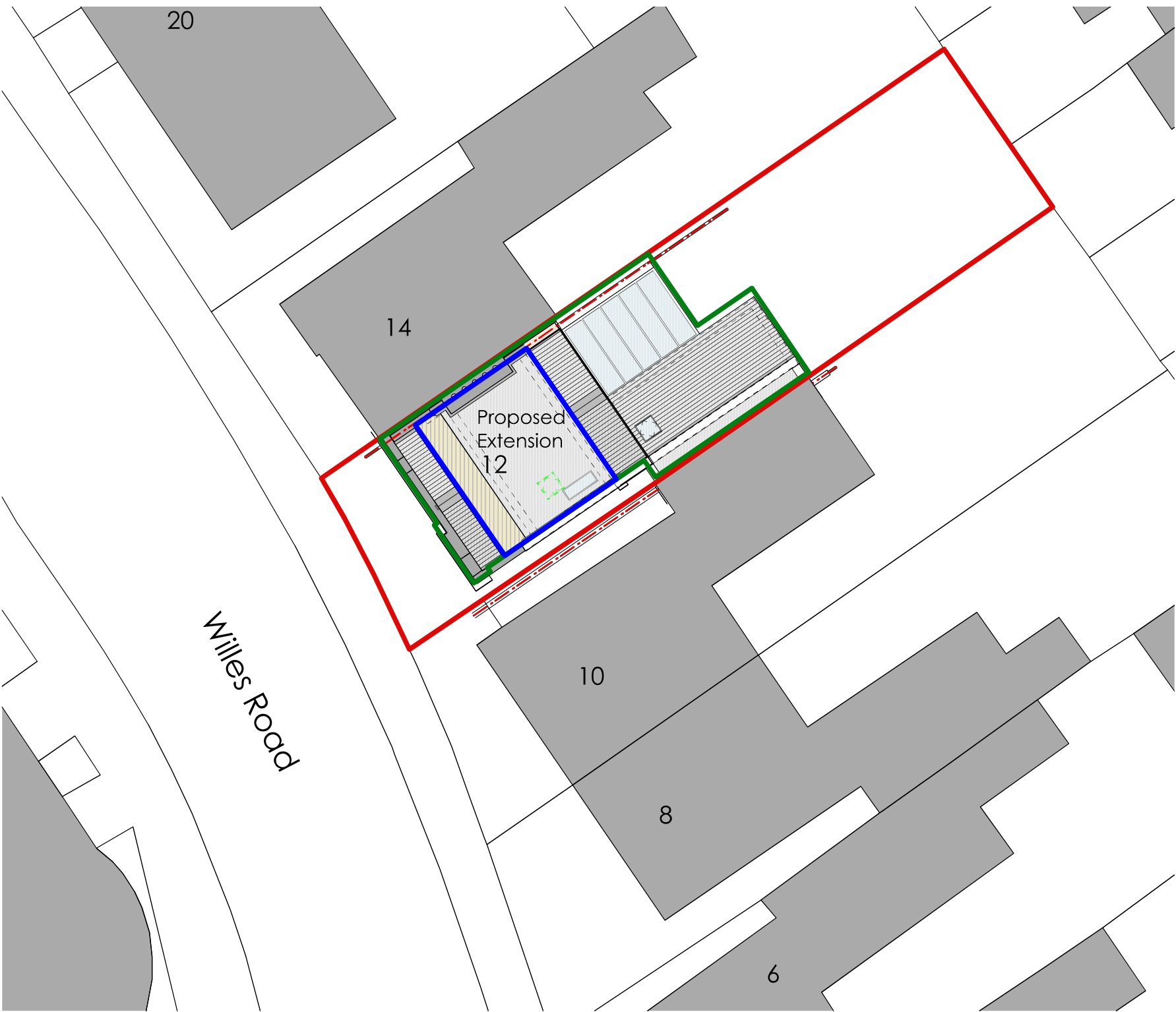
2 Site Layout Plan scale: 1:200 @ A3