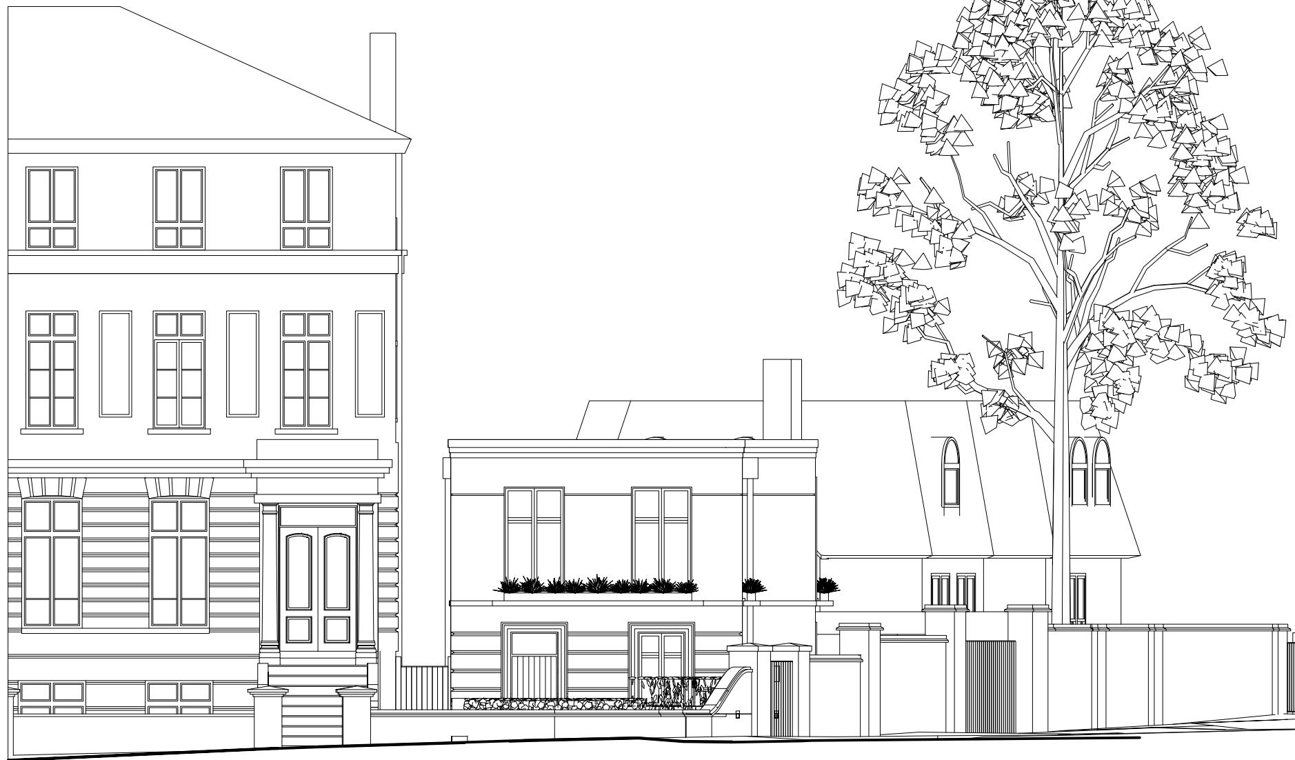
D1 004 VIEW FROM PRIORY TERRACE / SOUTH EAST ELEVATION