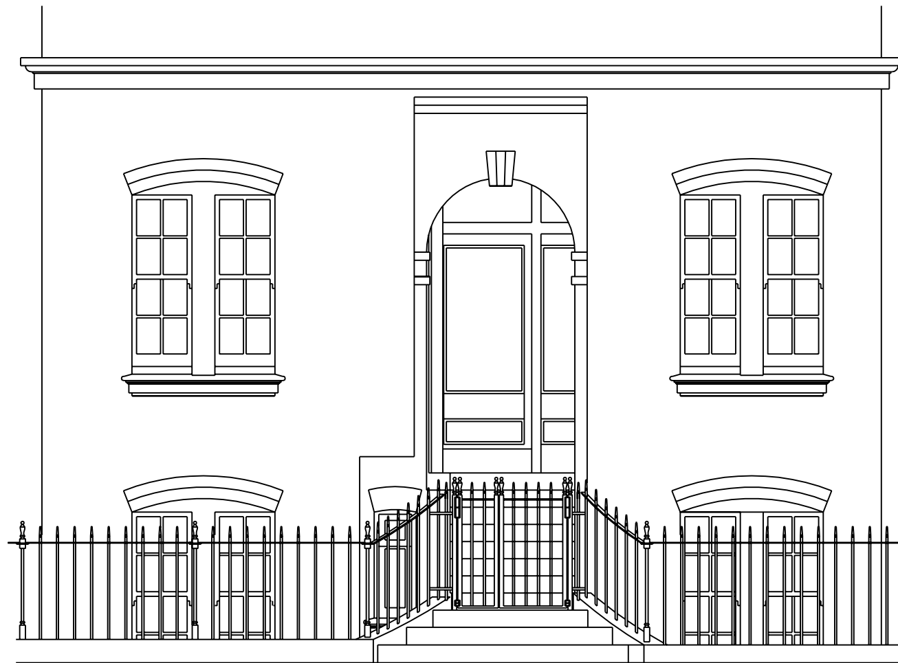
1-30 Rashleigh House

Tel: 07724 171614 Website: contract35.co.uk Email: contract35@gmail.com