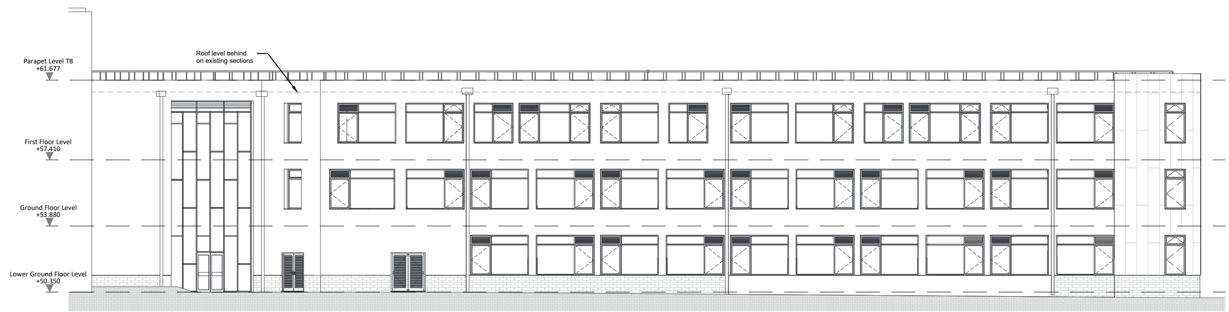
Existing: North Courtyard Elevation

NOTES PV Panels Dotted line indicates PV panels behind parapet