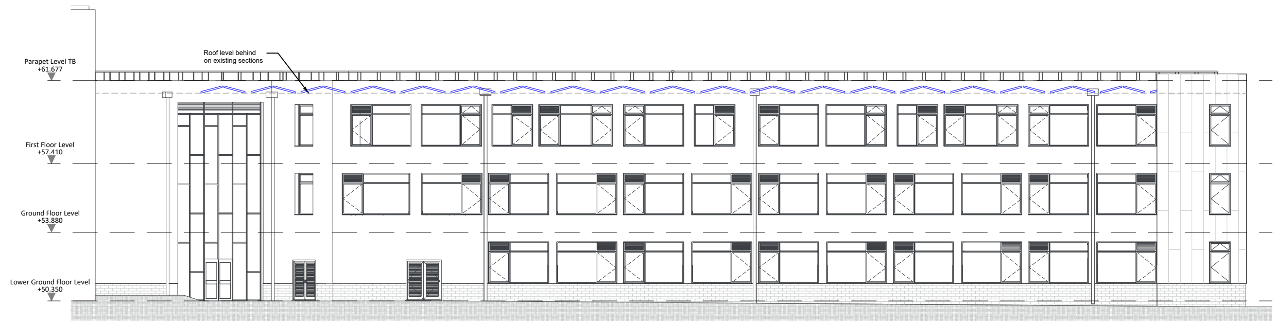
Proposed: North Courtyard Elevation